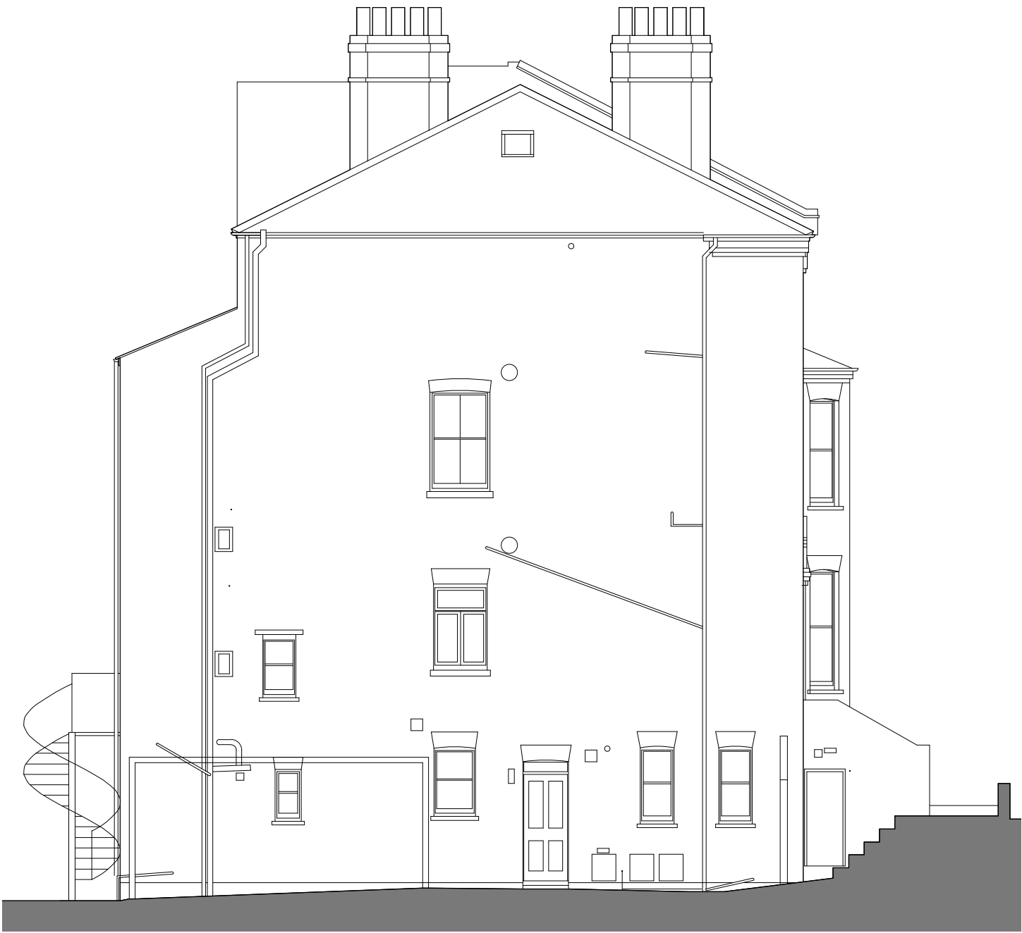
01 EXISTING EAST ELEVATION