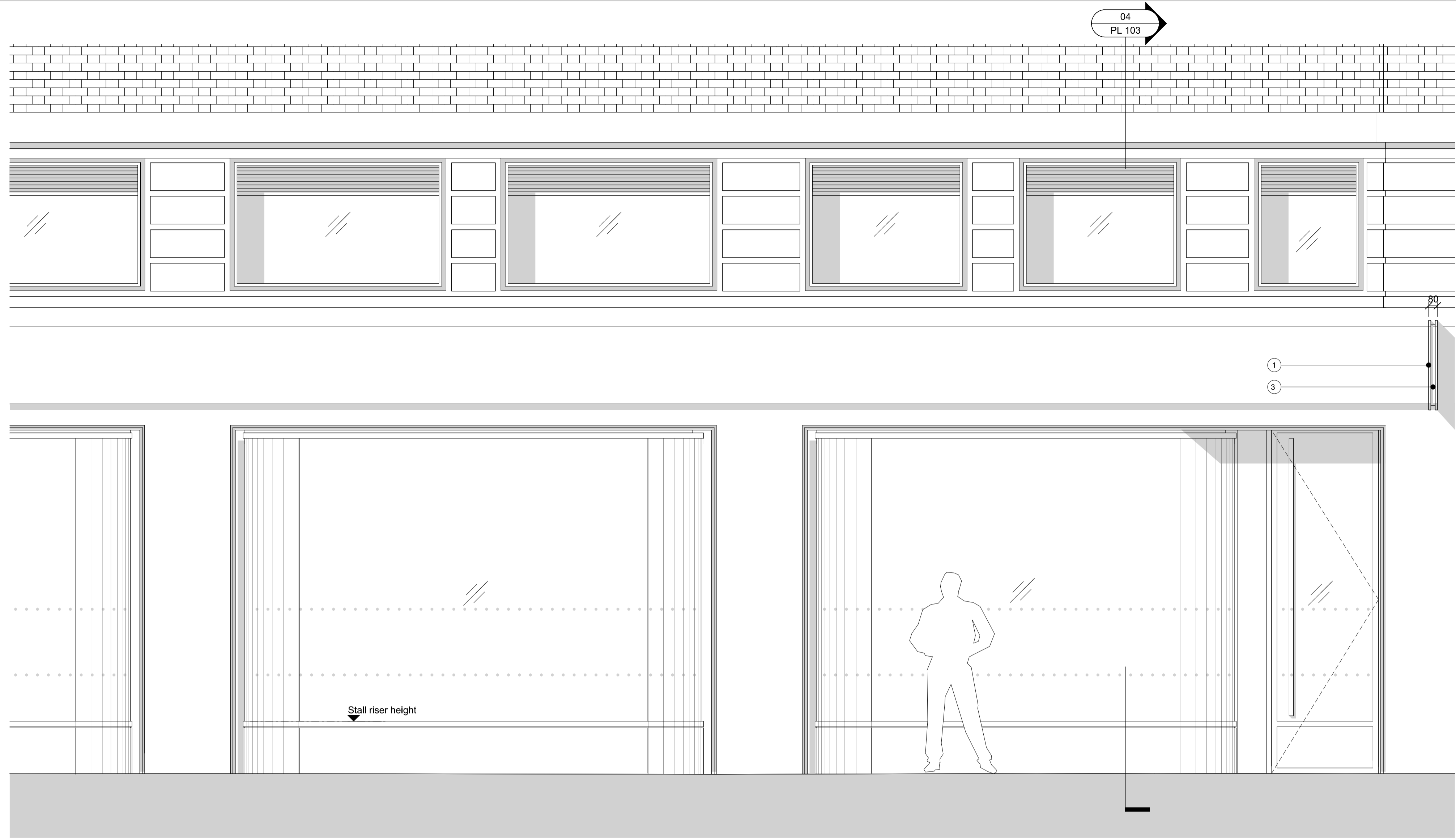
01 - Retail Unit 4B Entrance - Elevation Scale 1:25