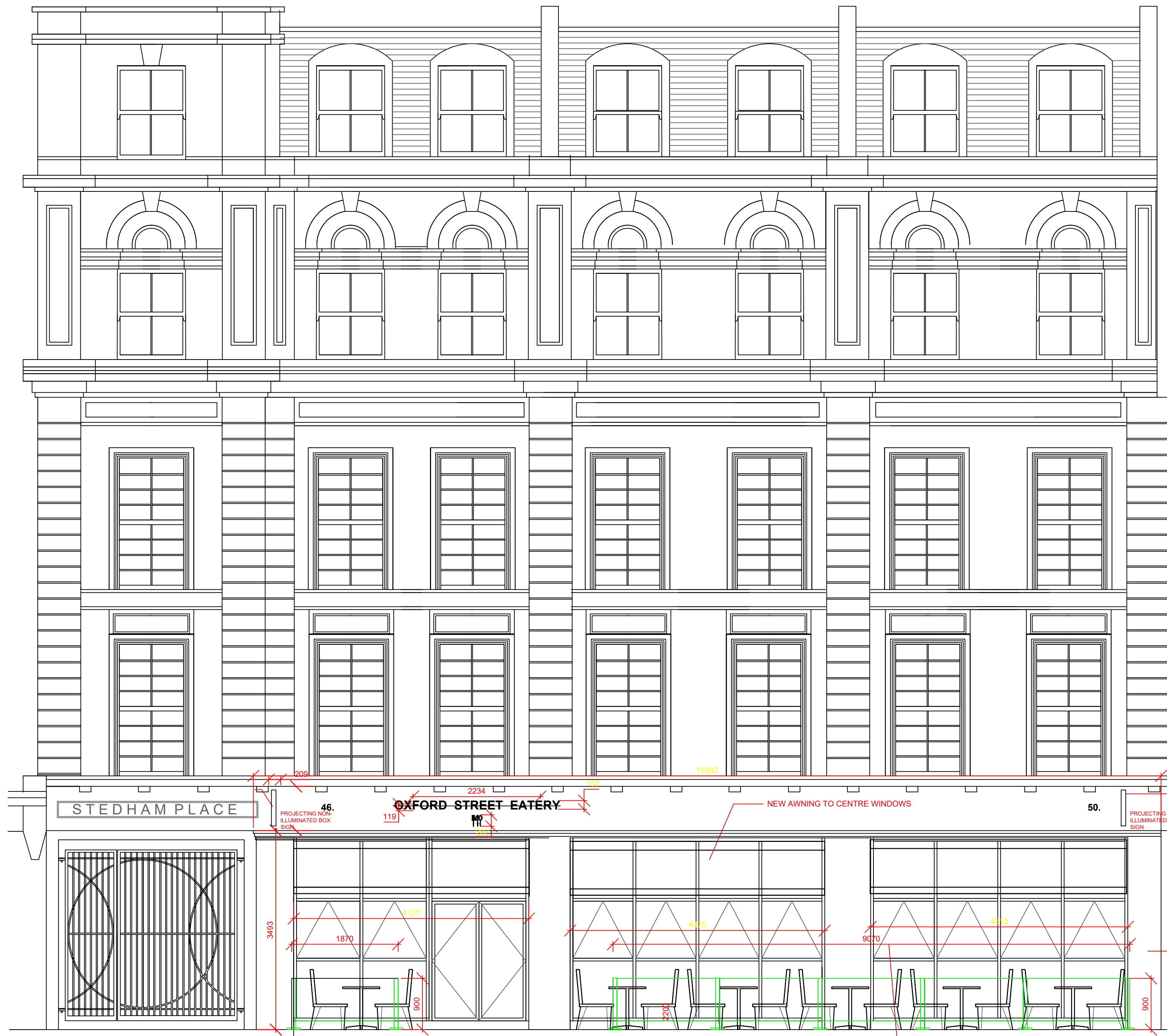
PROPOSED SHOPFRONT ELEVATION SCALE 1:50