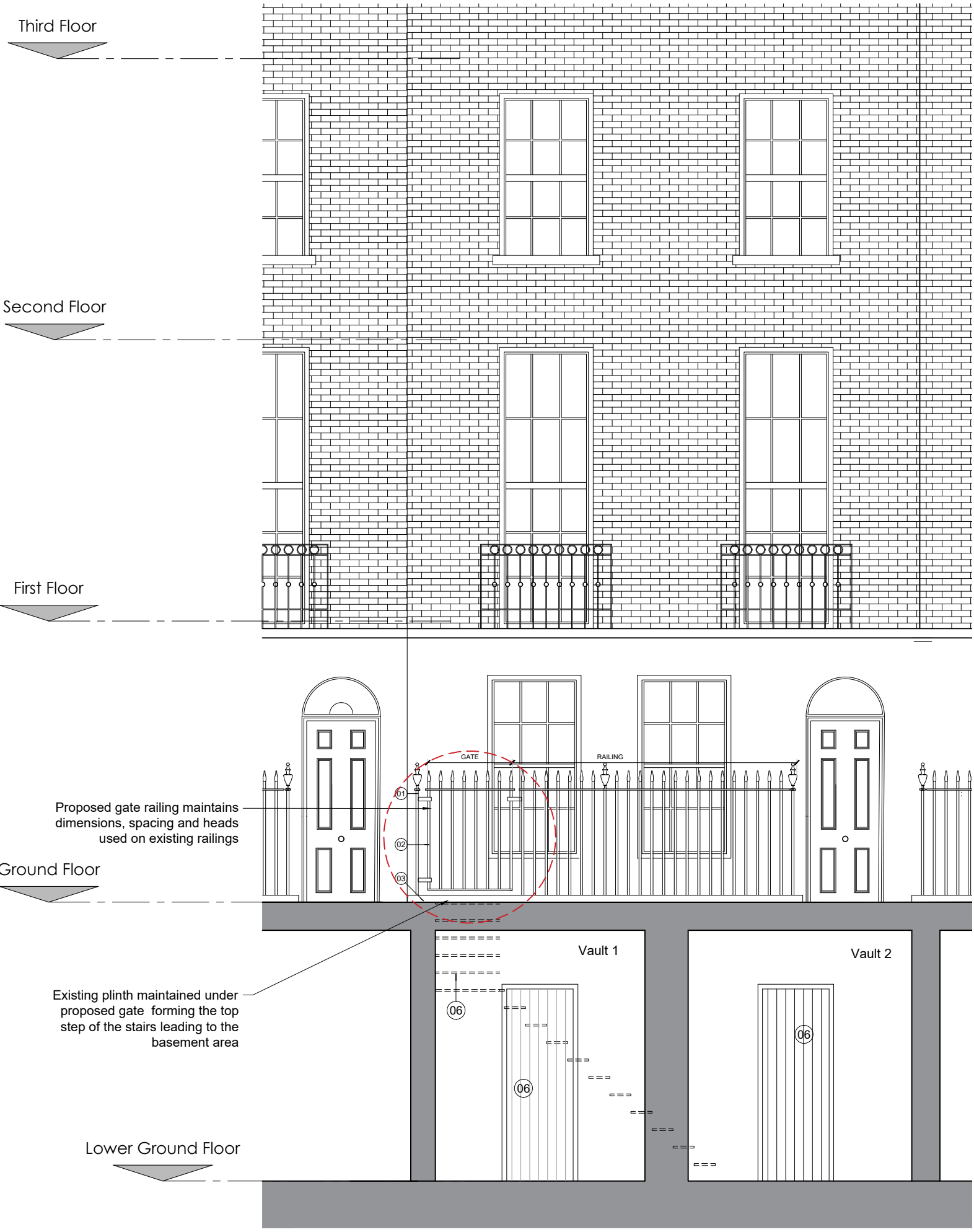
1 Section D-D 1:50