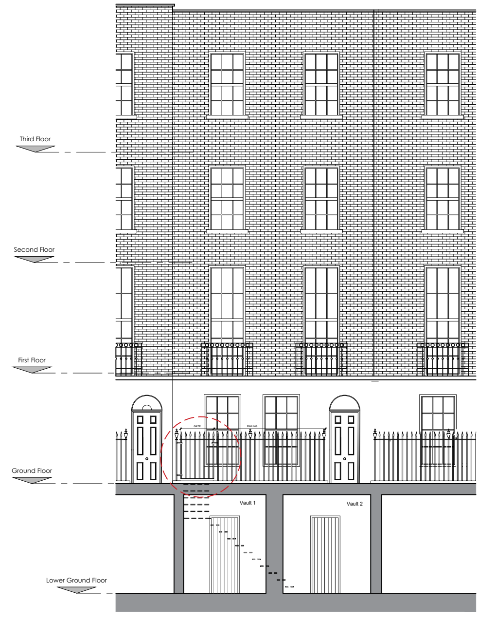
02 Section D-D 1:100