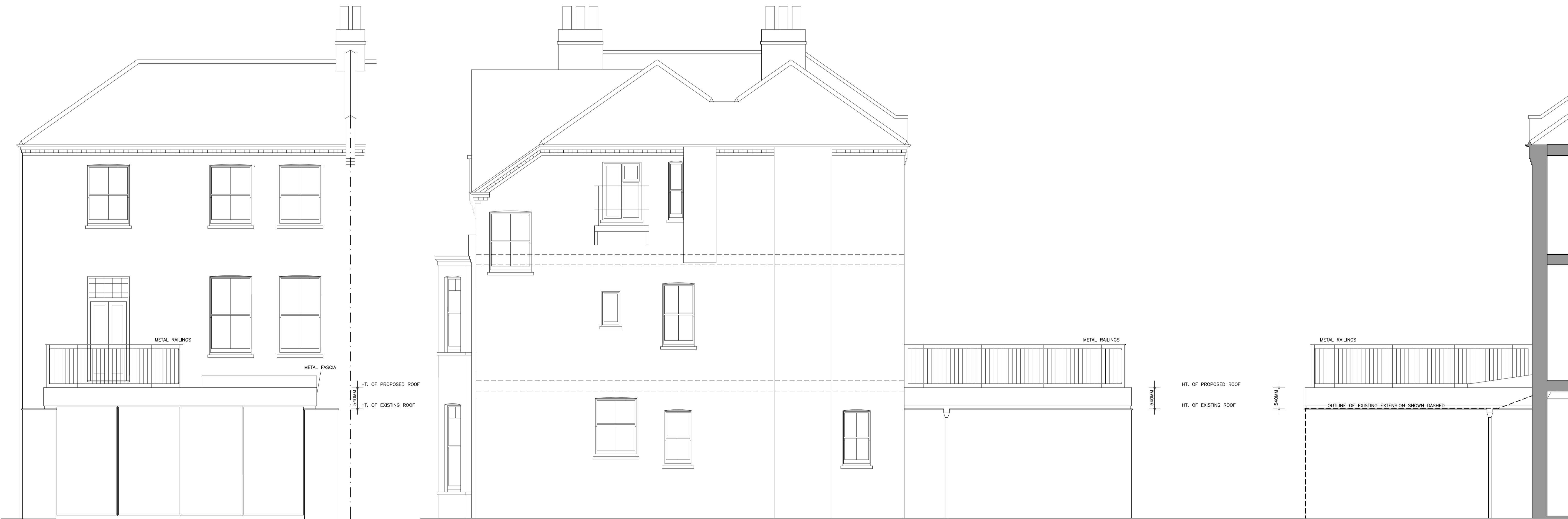
Rear (South East) Elevation