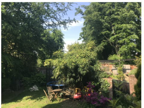
existing site photographs