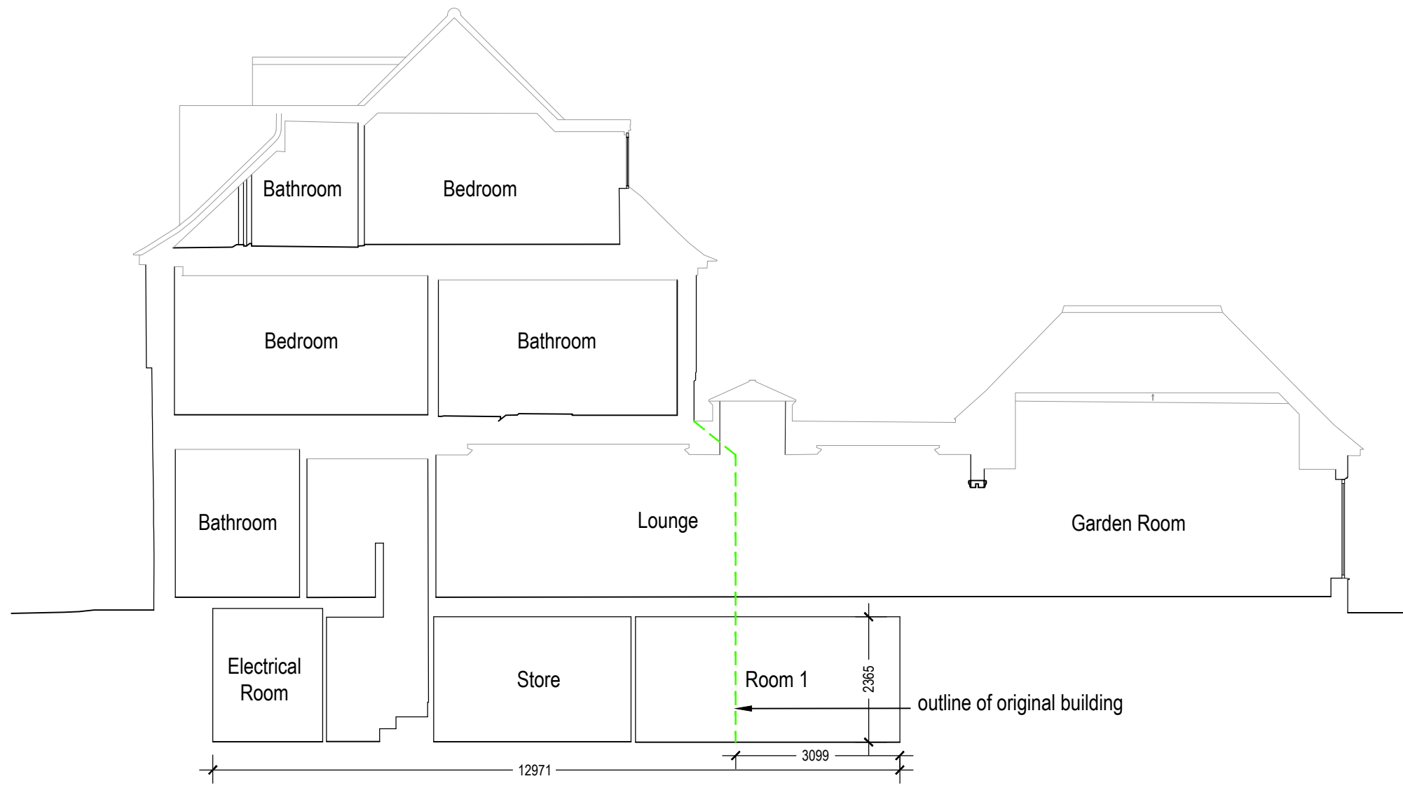
Existing Section 01 SCALE 1:100@A3