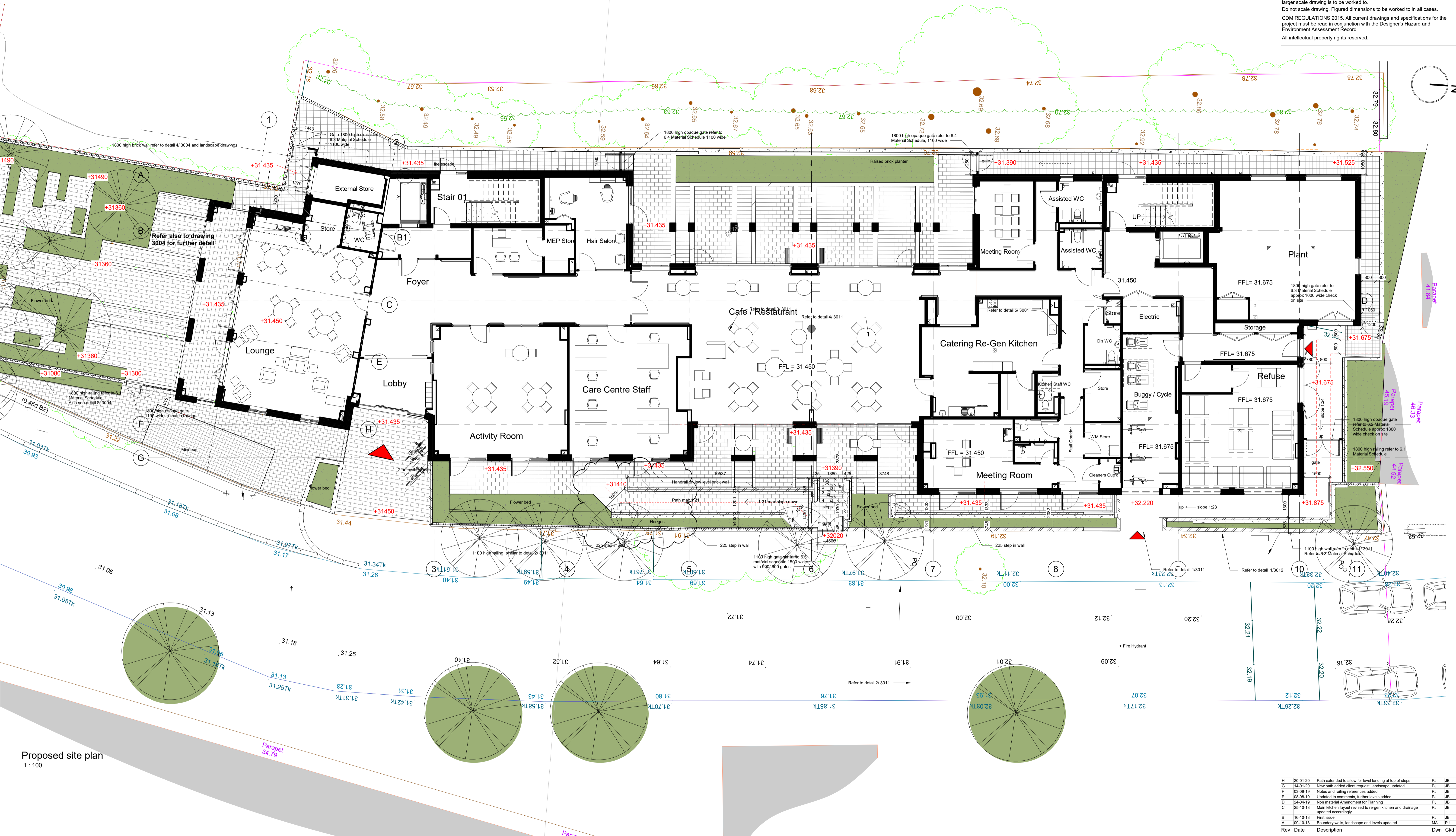
Proposed site plan 1:100

The contractor is responsible for checking dimensions, tolerances and references. Any discrepancy to be verified with the Architect before proceeding with the works. Where an item is covered by drawings to different scales the larger scale drawing is to be worked to. Do not scale drawing. Figured dimensions to be worked to in all cases. CDM REGULATIONS 2015. All current drawings and specifications for the project must be read in conjunction with the Designer's Hazard and Environment Assessment Record All intellectual property rights reserved.