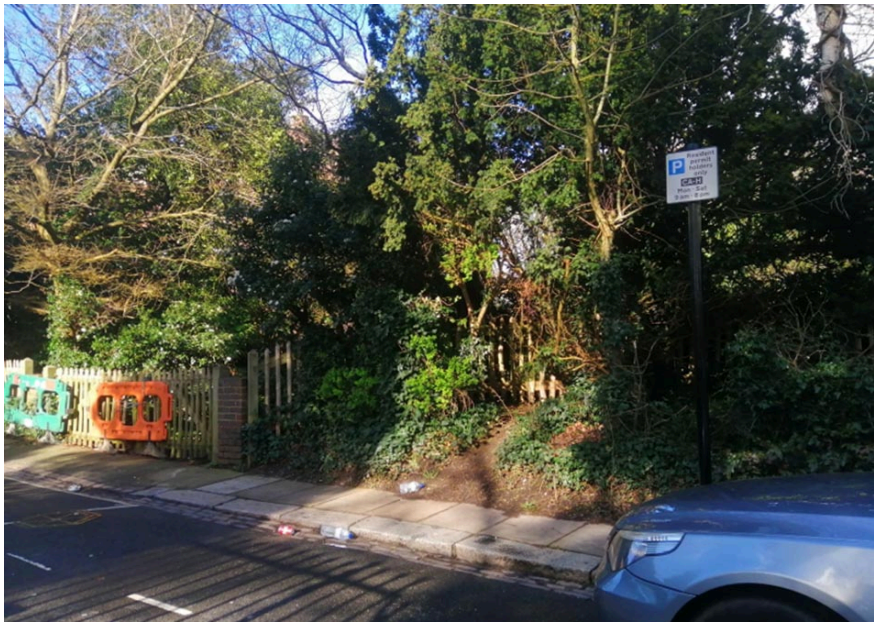
LOCATION A WITHOUT POLE