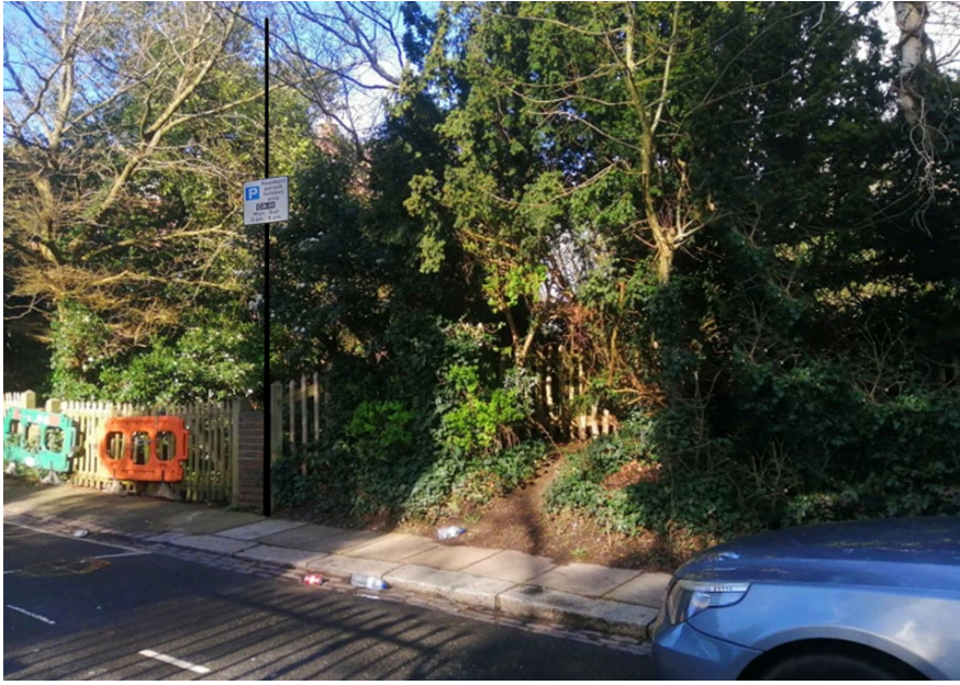
LOCATION A WITH POLE