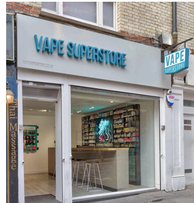
3 Precedent Photograph - Soho

Note; Lumes: The light is reflected through an opal face, so the light output is 80cd/m2