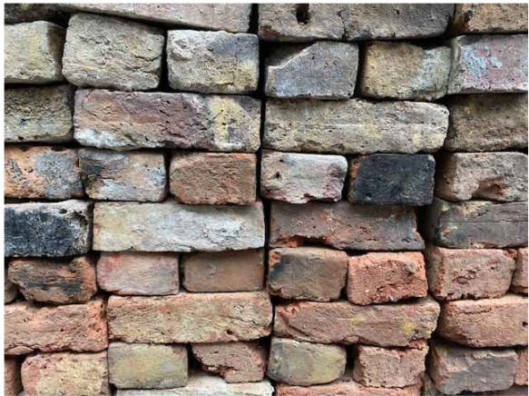
03 PROPOSED RECLAIMED BRICKS