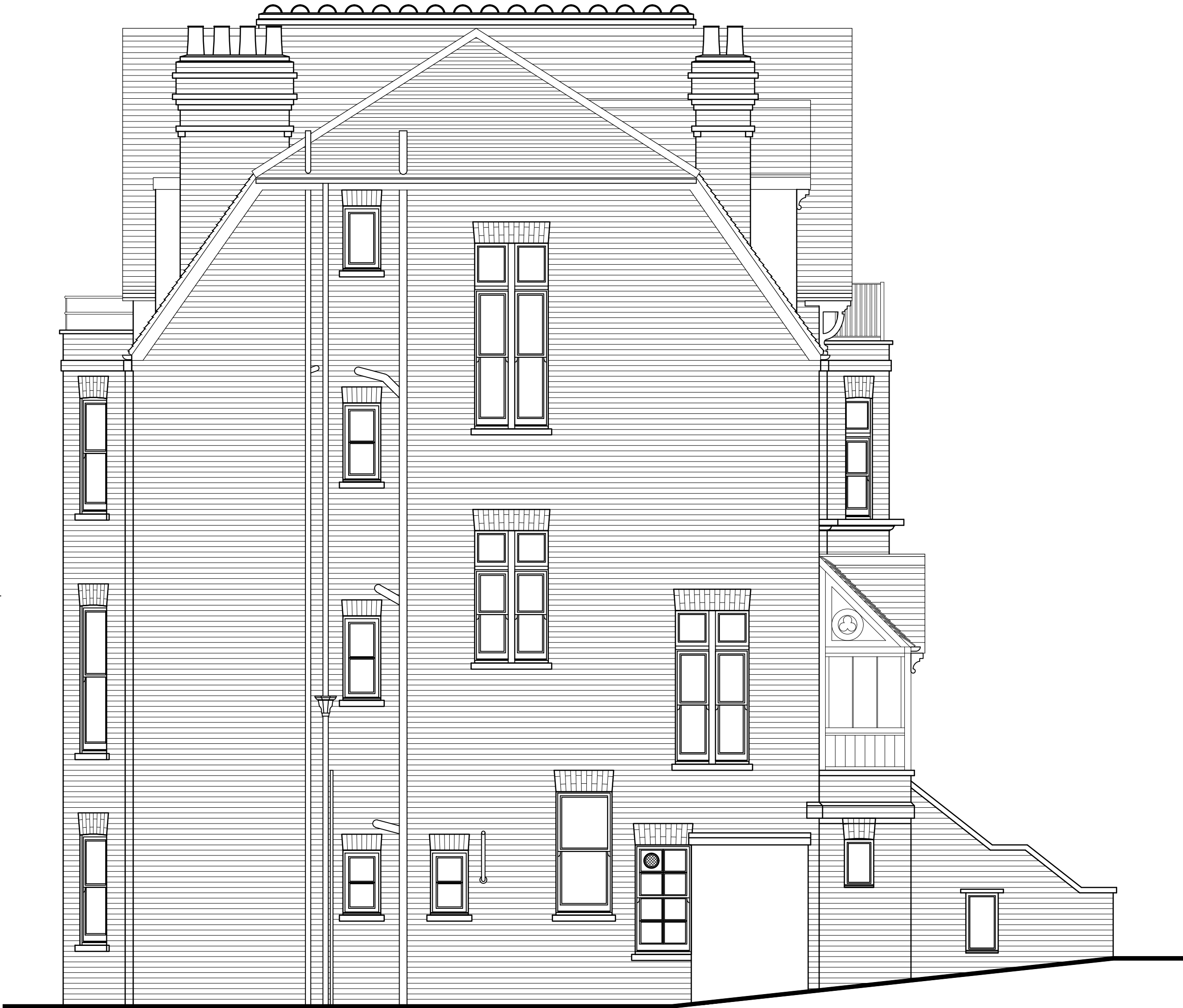
SIDE ELEVATION (SOUTH)