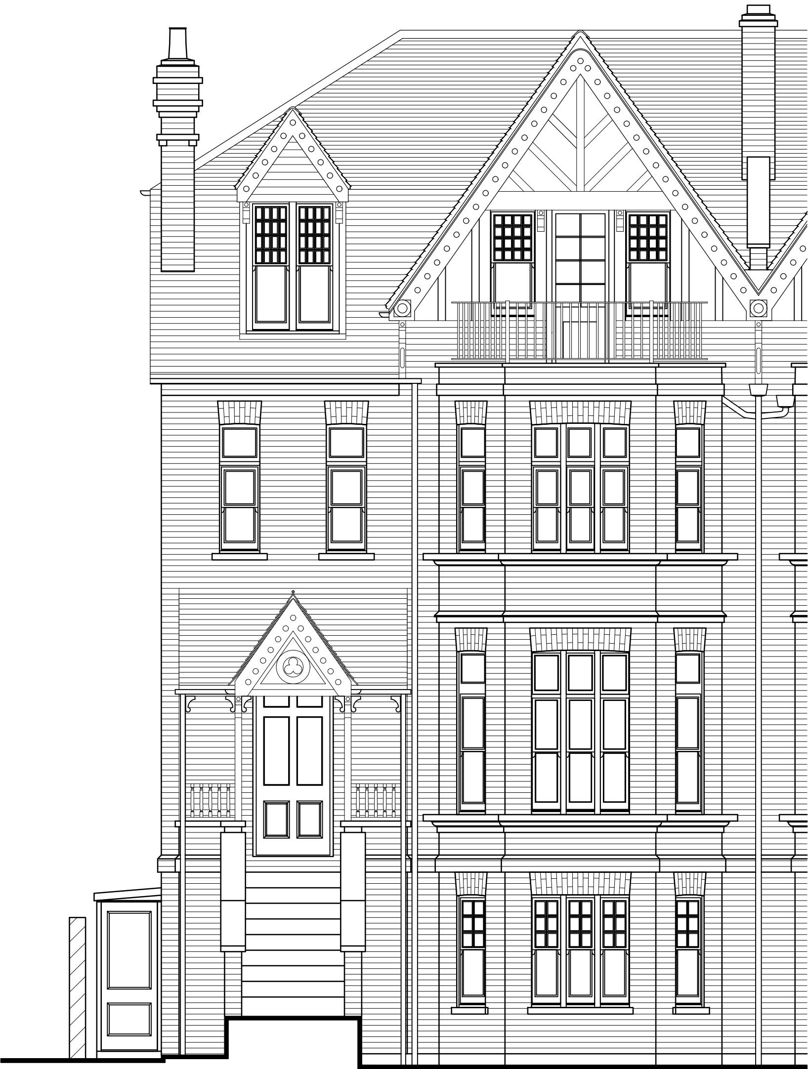
FRONT ELEVATION (EAST)