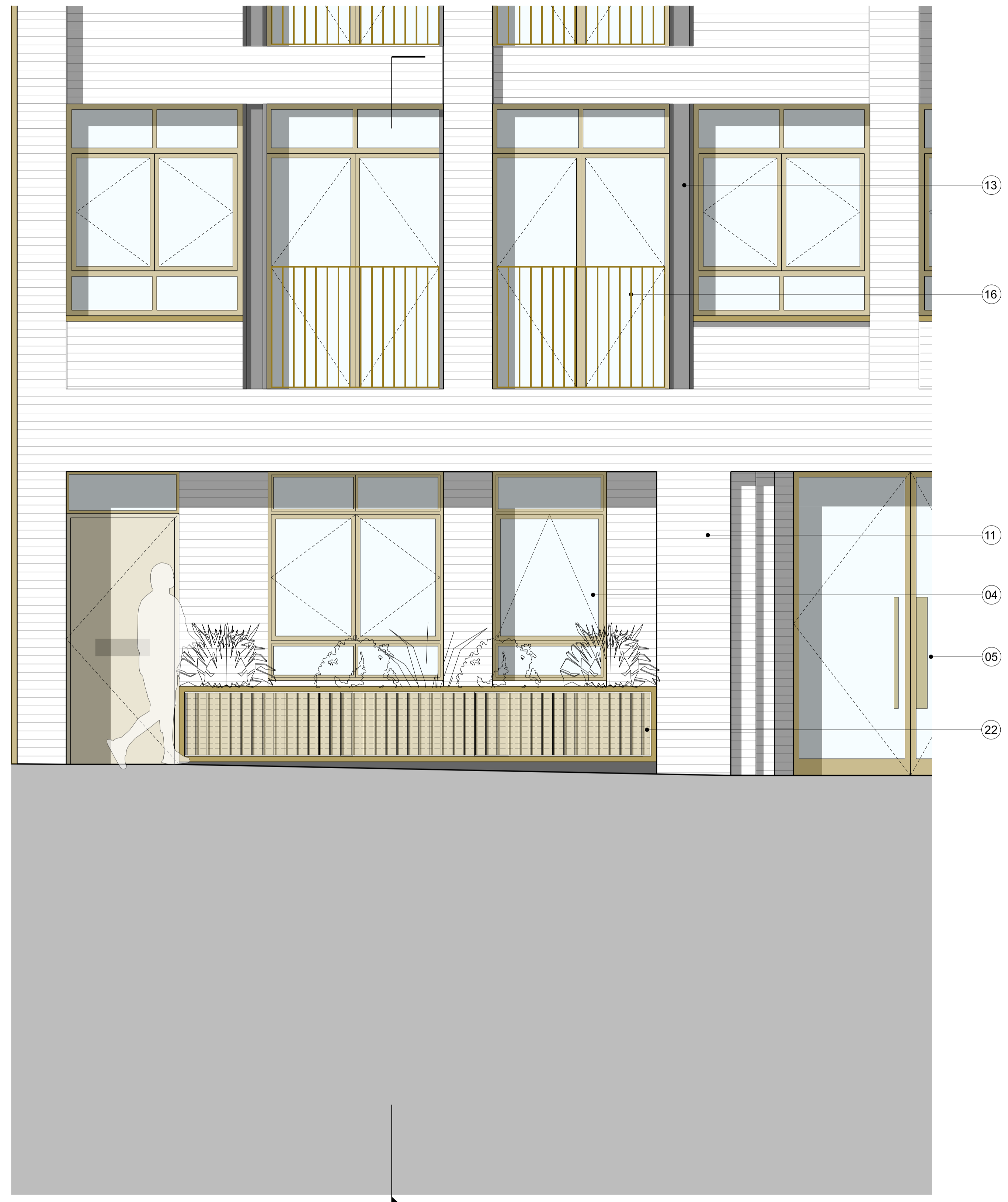
01 BAY ELEVATION: EAST ELEVATION LOWER