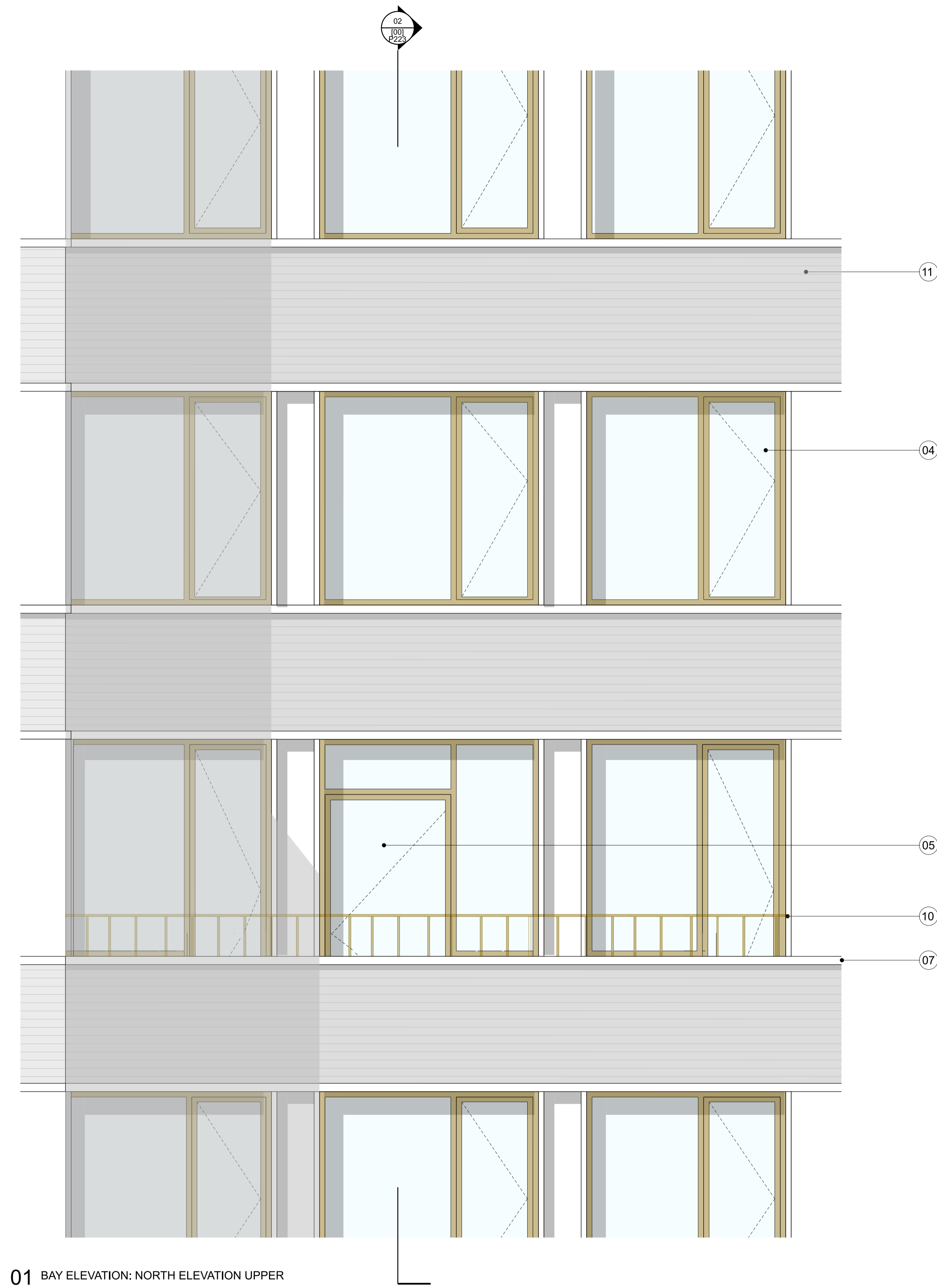
01 BAY ELEVATION: NORTH ELEVATION UPPER