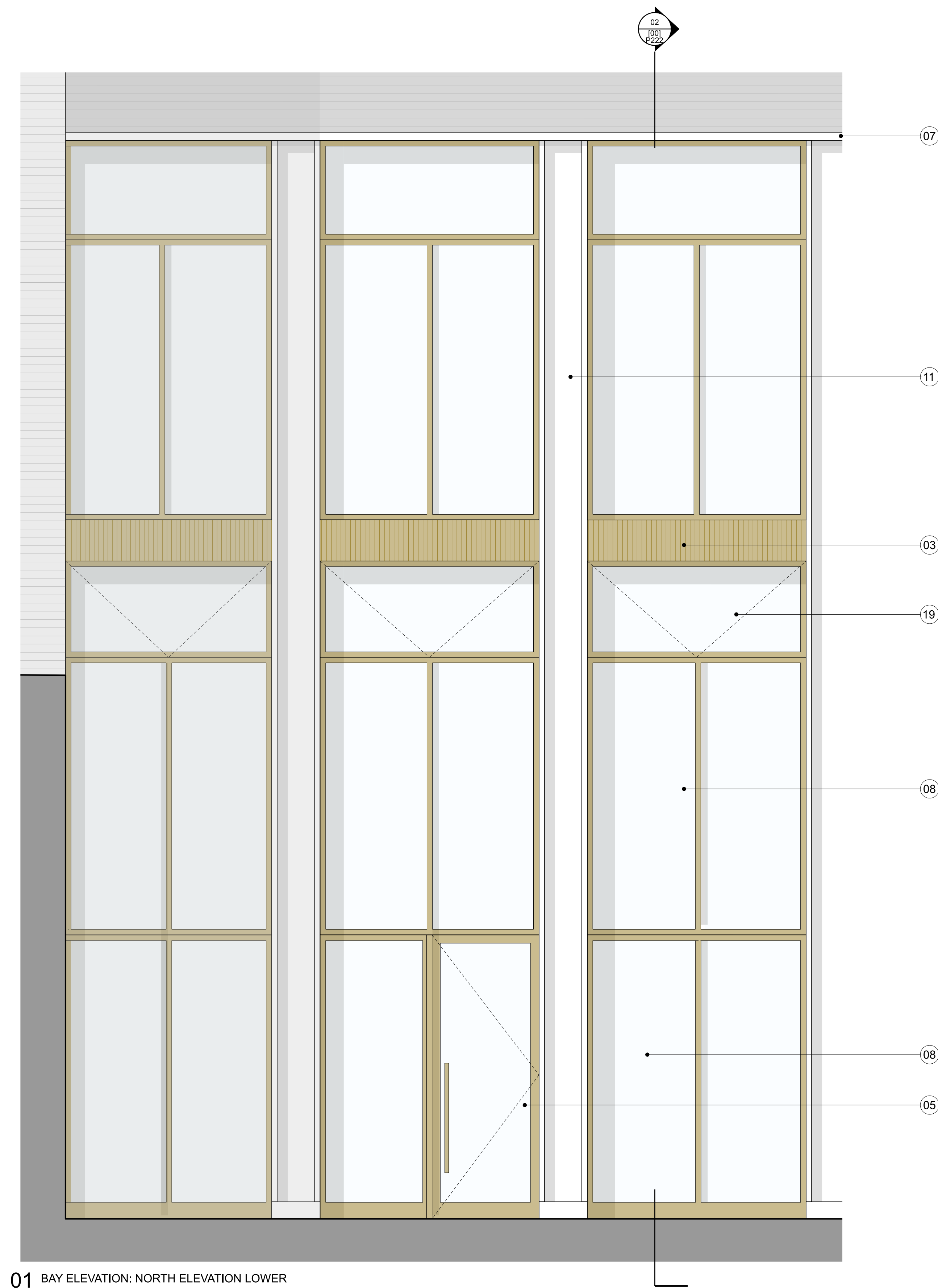
01 BAY ELEVATION: NORTH ELEVATION LOWER