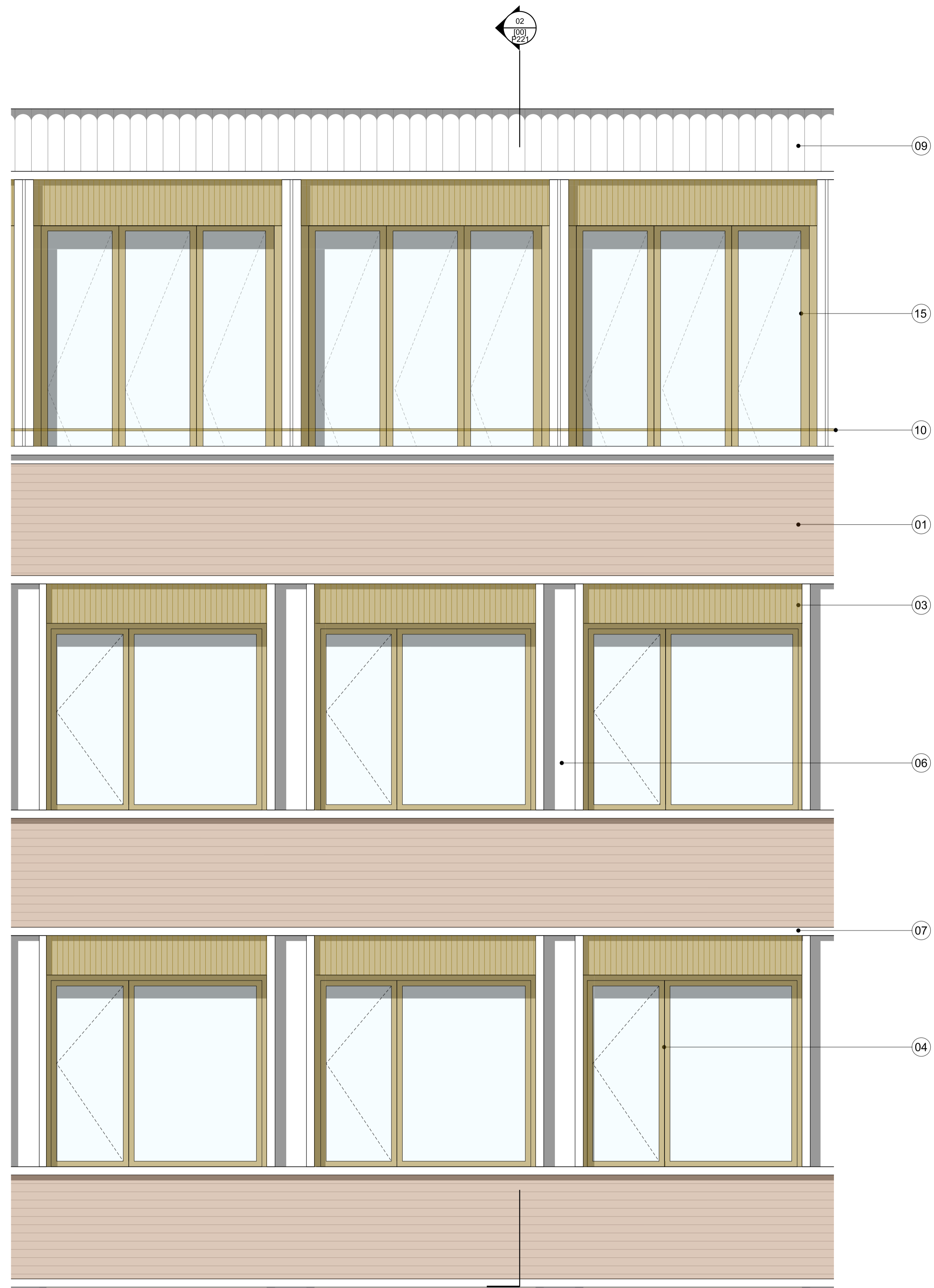
01 BAY ELEVATION: SOUTH ELEVATION UPPER