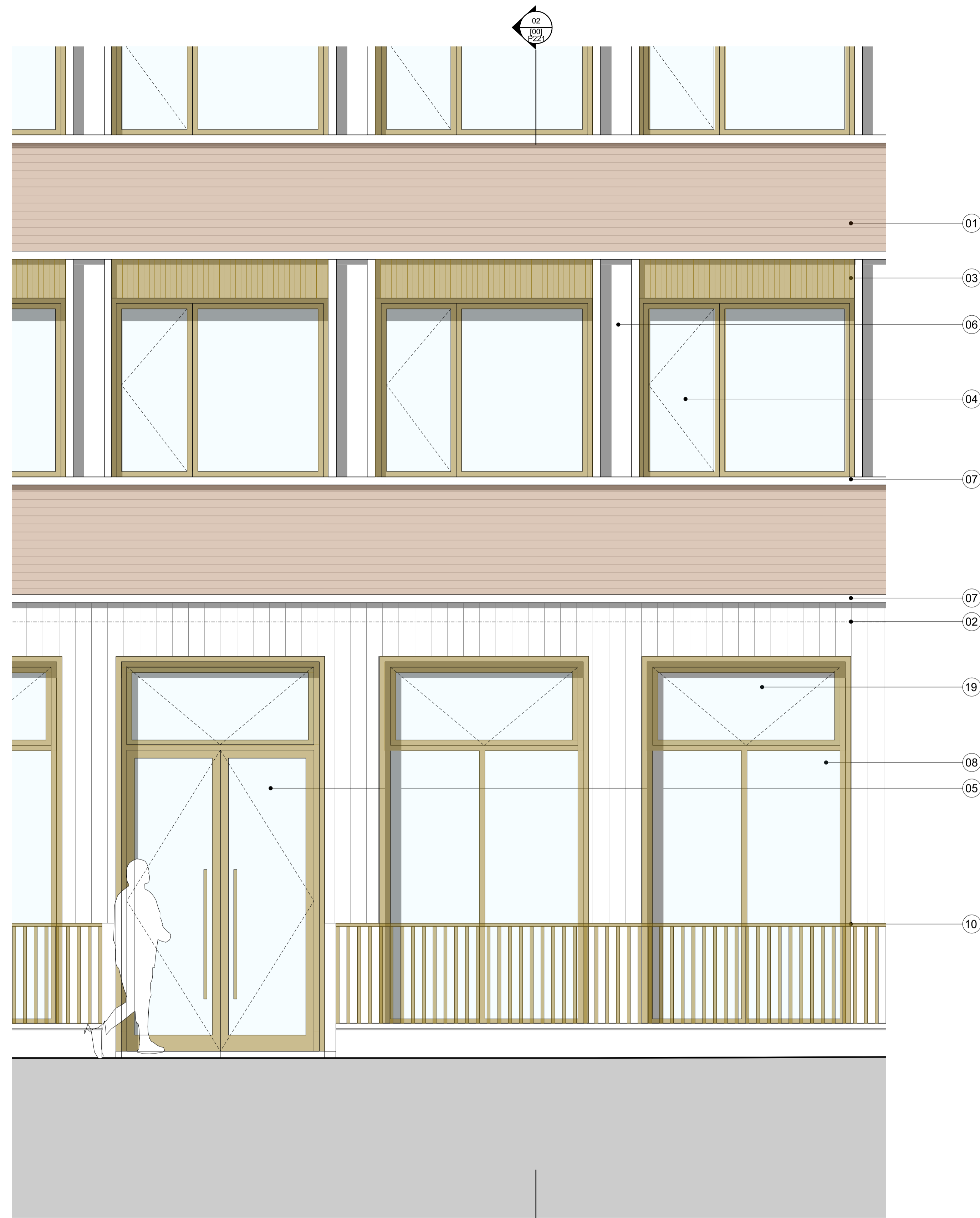
01 BAY ELEVATION: SOUTH ELEVATION LOWER