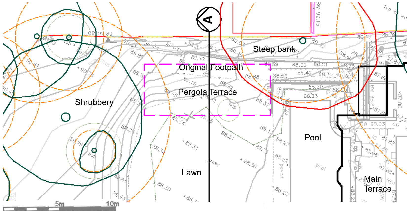
Left: Topographical survey showing existing levels, contours, extent of hard surfacing and vegetation for context. Pink dotted line shows extent of pergola terrace on plan.