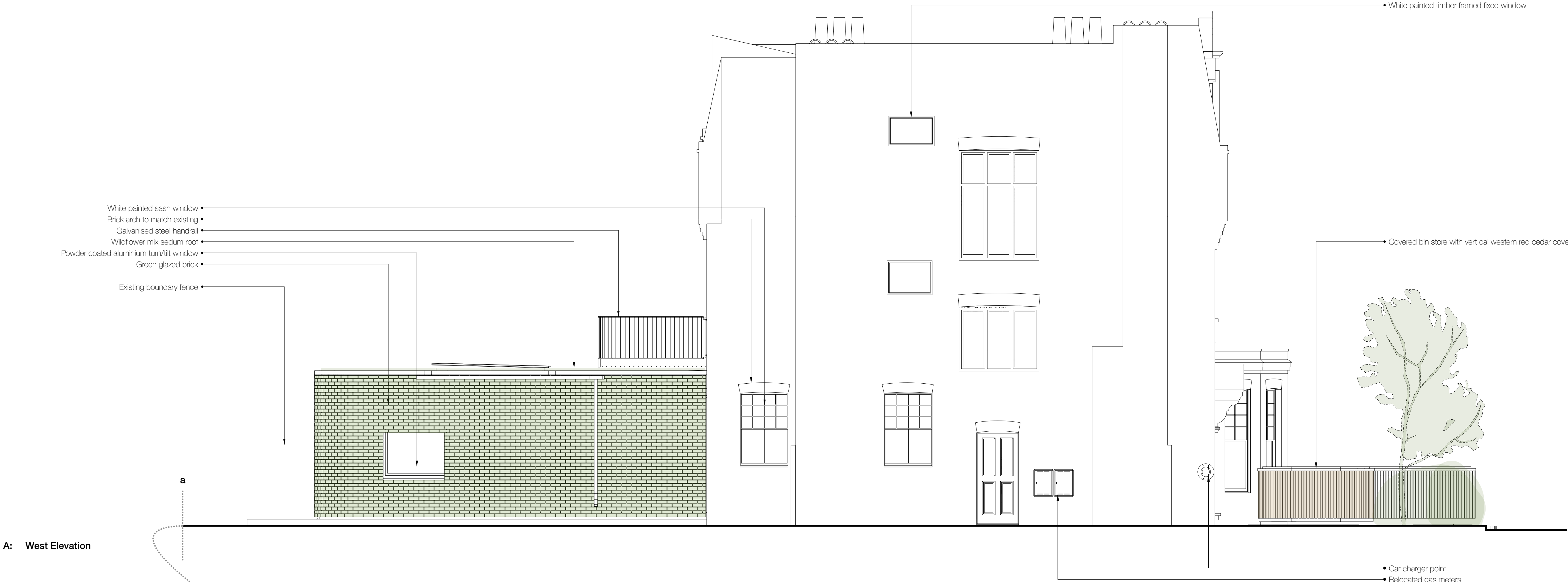
A: West Elevation

© This drawing copyright Barnaby Gunning 2020 Do not scale from this drawing. Dimensions to be verified on site prior to construction. Unless otherwise indicated, all dimensions are in millimetres.