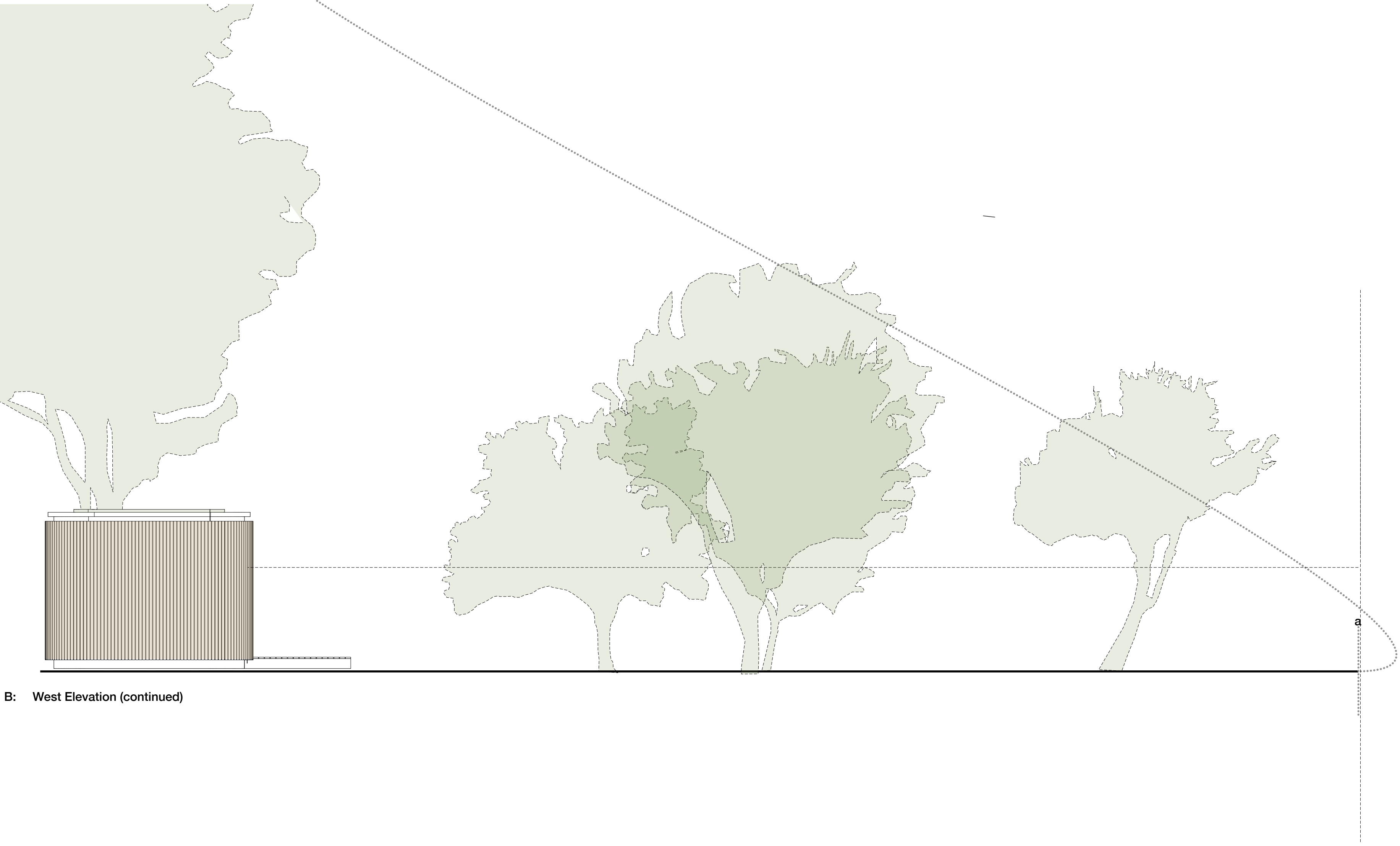
B: West Elevation (continued)