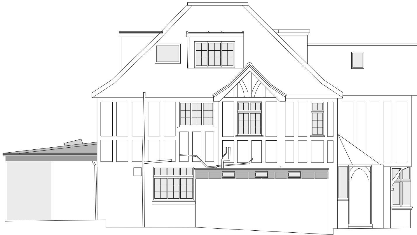
1 South Elevation