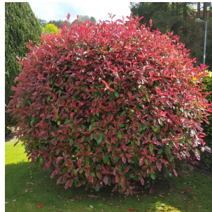
Photinia Red Robin

Proposed black metal plant troughs to perimeter of terrace area :