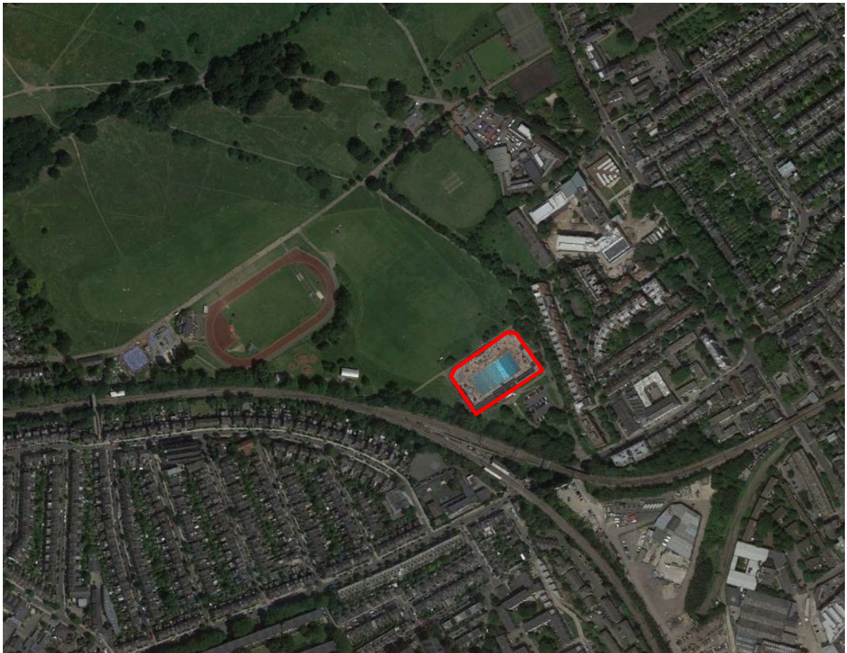
Figure 1: Location of Parliament Hill Fields Lido