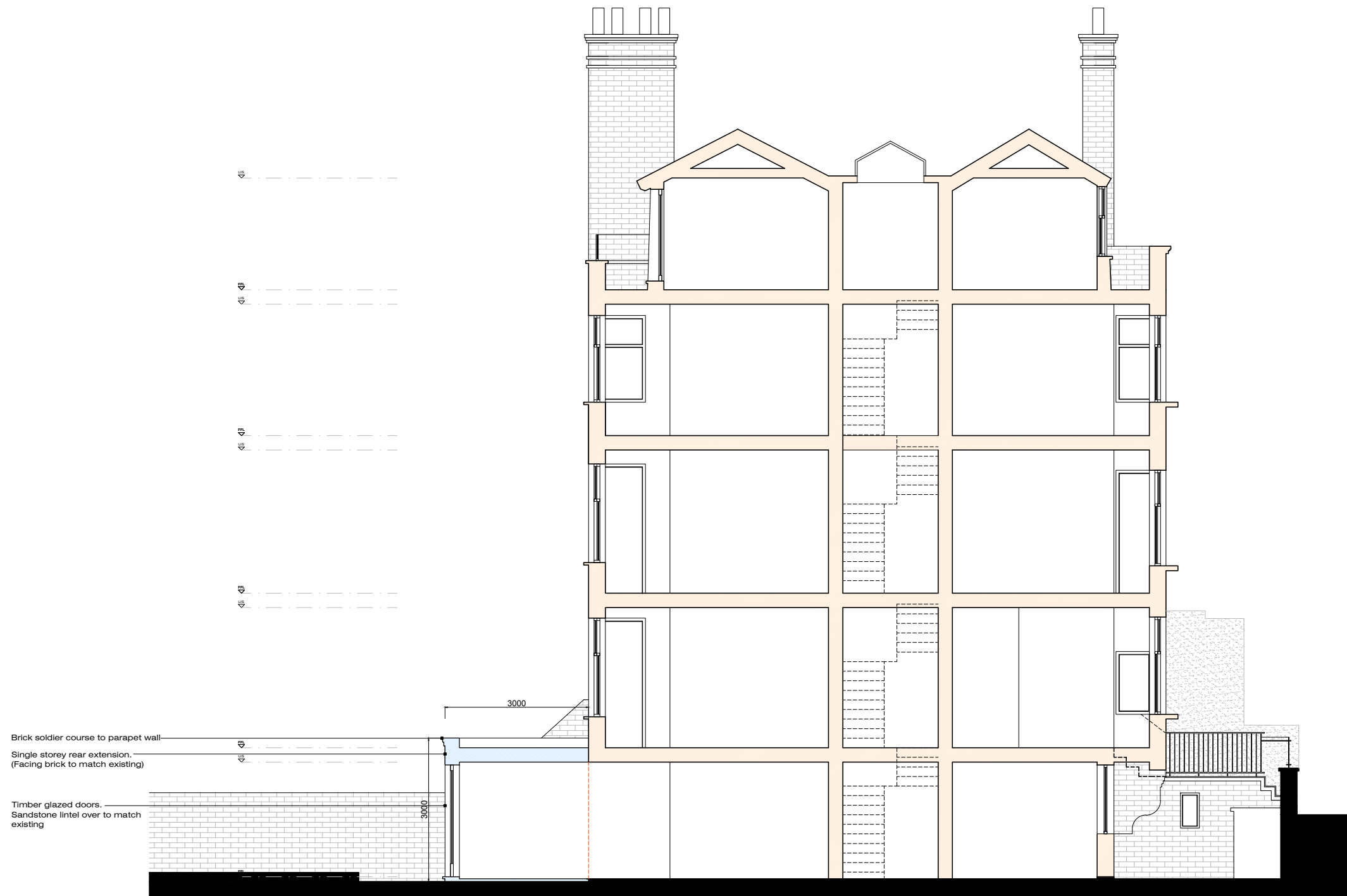
01 Proposed Section AA 1:100 @A3