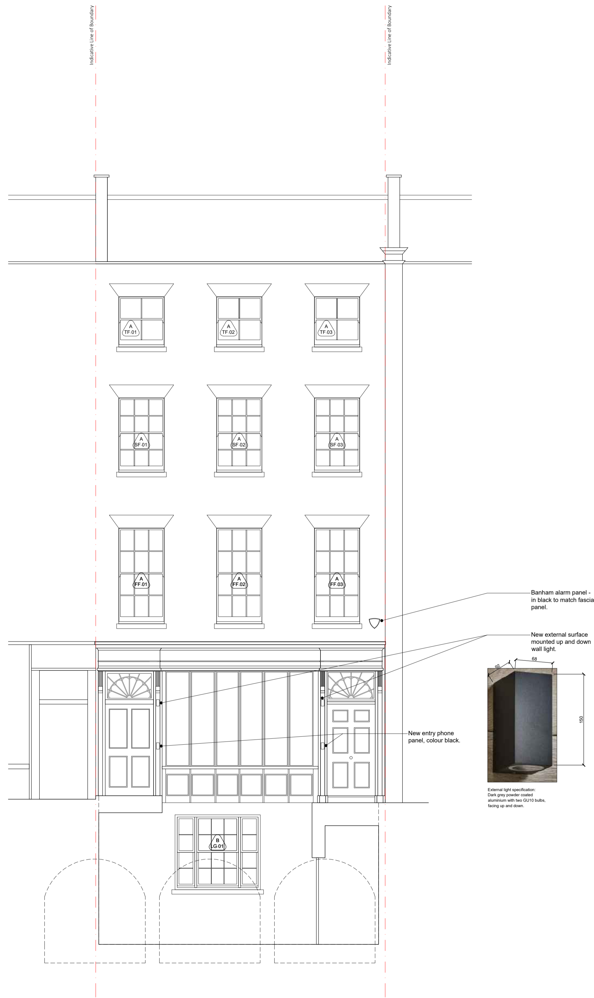
Proposed West Elevation Section_BB