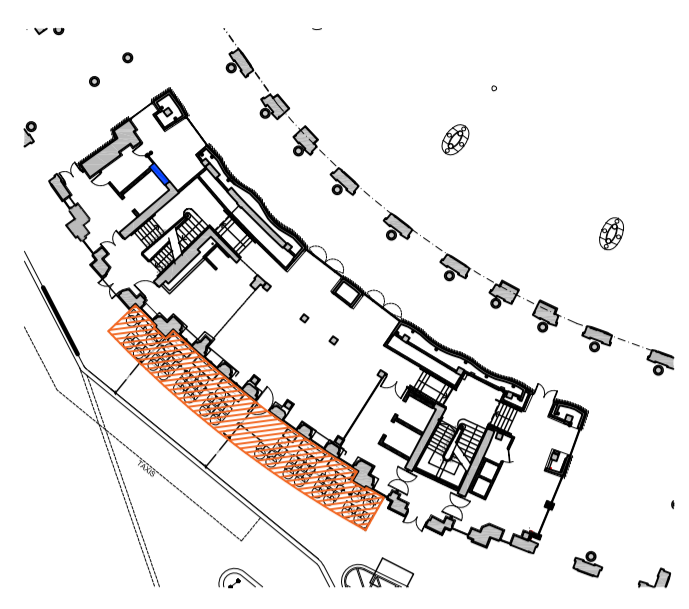
1 KEY PLAN NTS