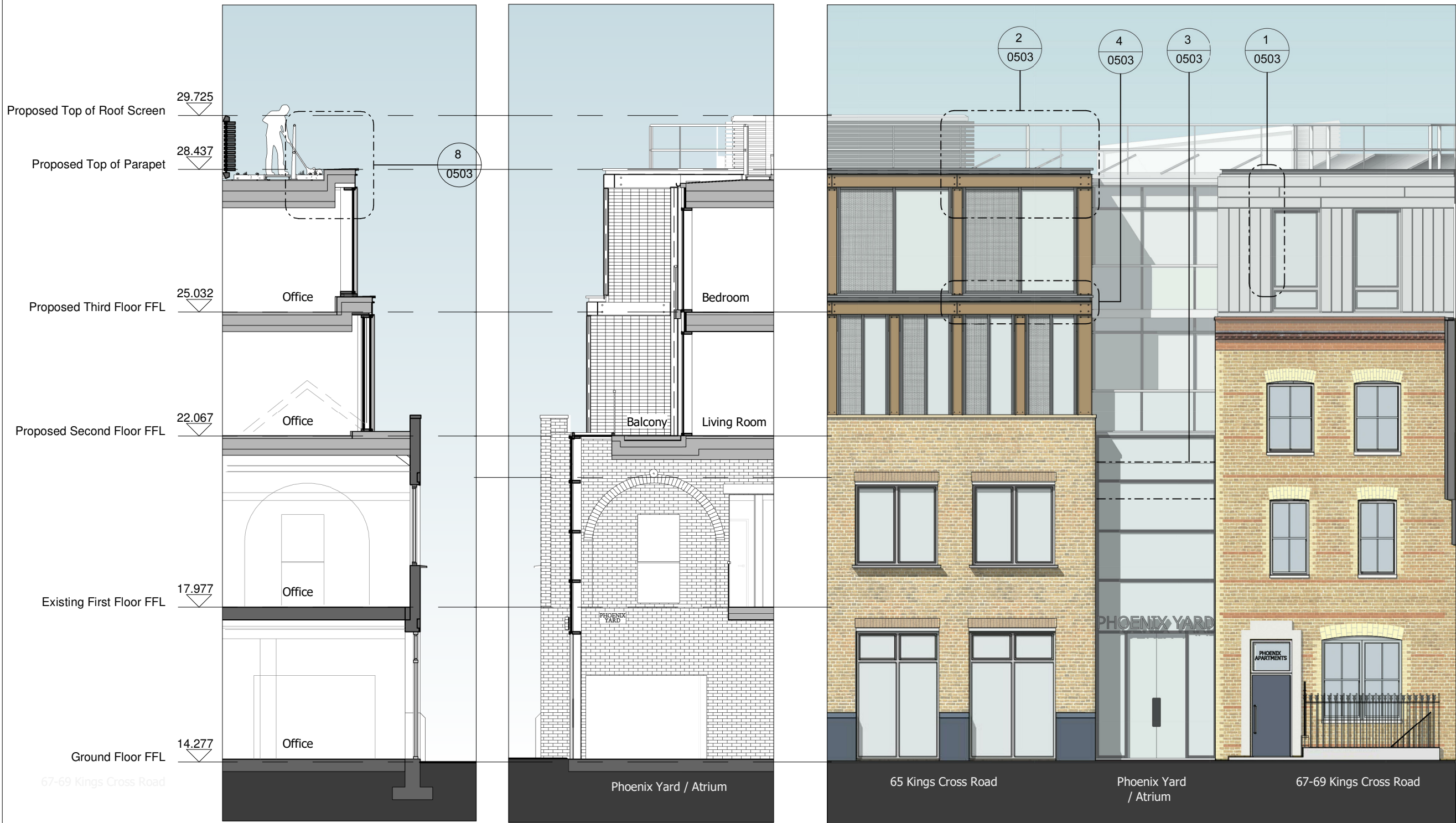
Section 2 (part)