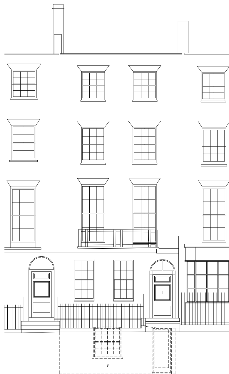
01 ORIGINAL NORTH ELEVATION PL004 SCALE 1:100 @ A3