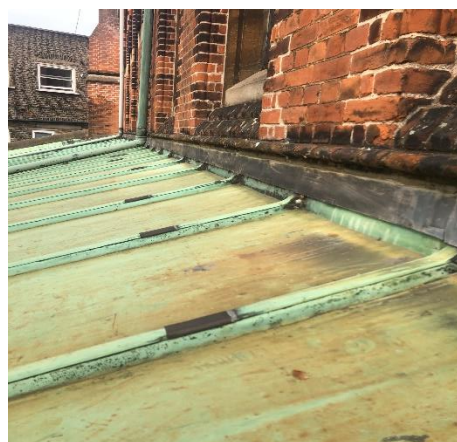
Patch repairs over batten rolls