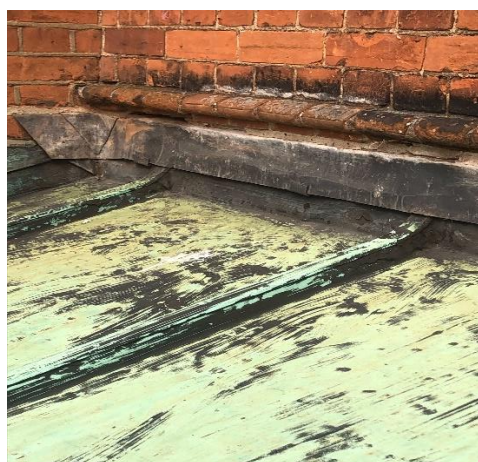
Missing pointing above lead flashing