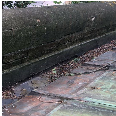
Missing pointing to parapet brickwork