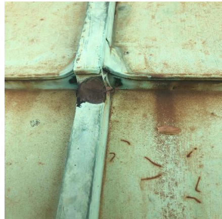
Repaired batten roll end with Mastic