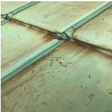
Evidence of rusting from underside corrosion