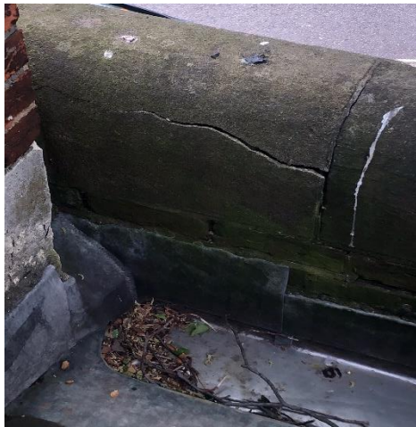
Large crack in coping