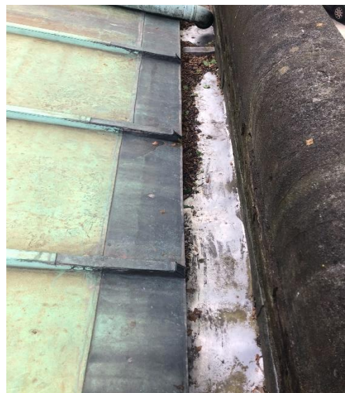
Stainless steel gutter lining