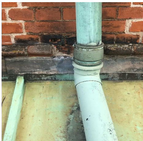
RW pipe unfixed at the bottom, poor brickwork.