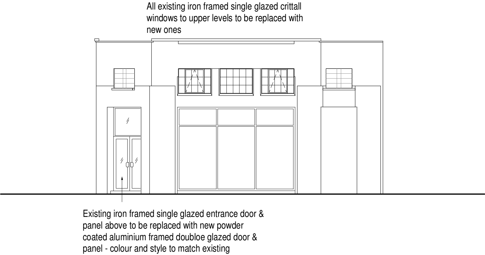
EUSTON ROAD ELEVATION (existing)

ALL DIMENSIONS SUBJECT TO MEASUREMENTS ON SITE. CONTRACTORS TO INFORM OF ANY MAJOR DISCREPANCIES SHOULD THEY APPEAR.