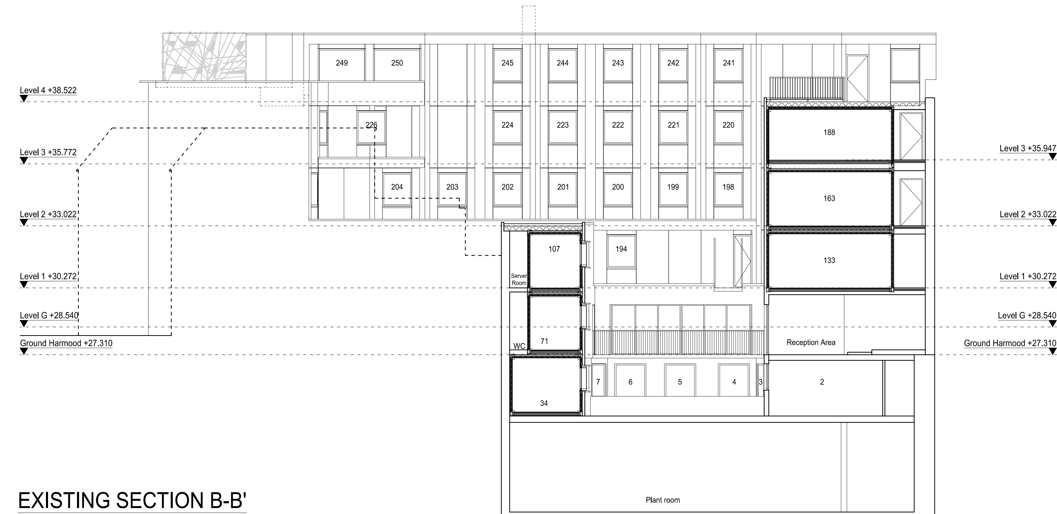
EXISTING SECTION B-B'