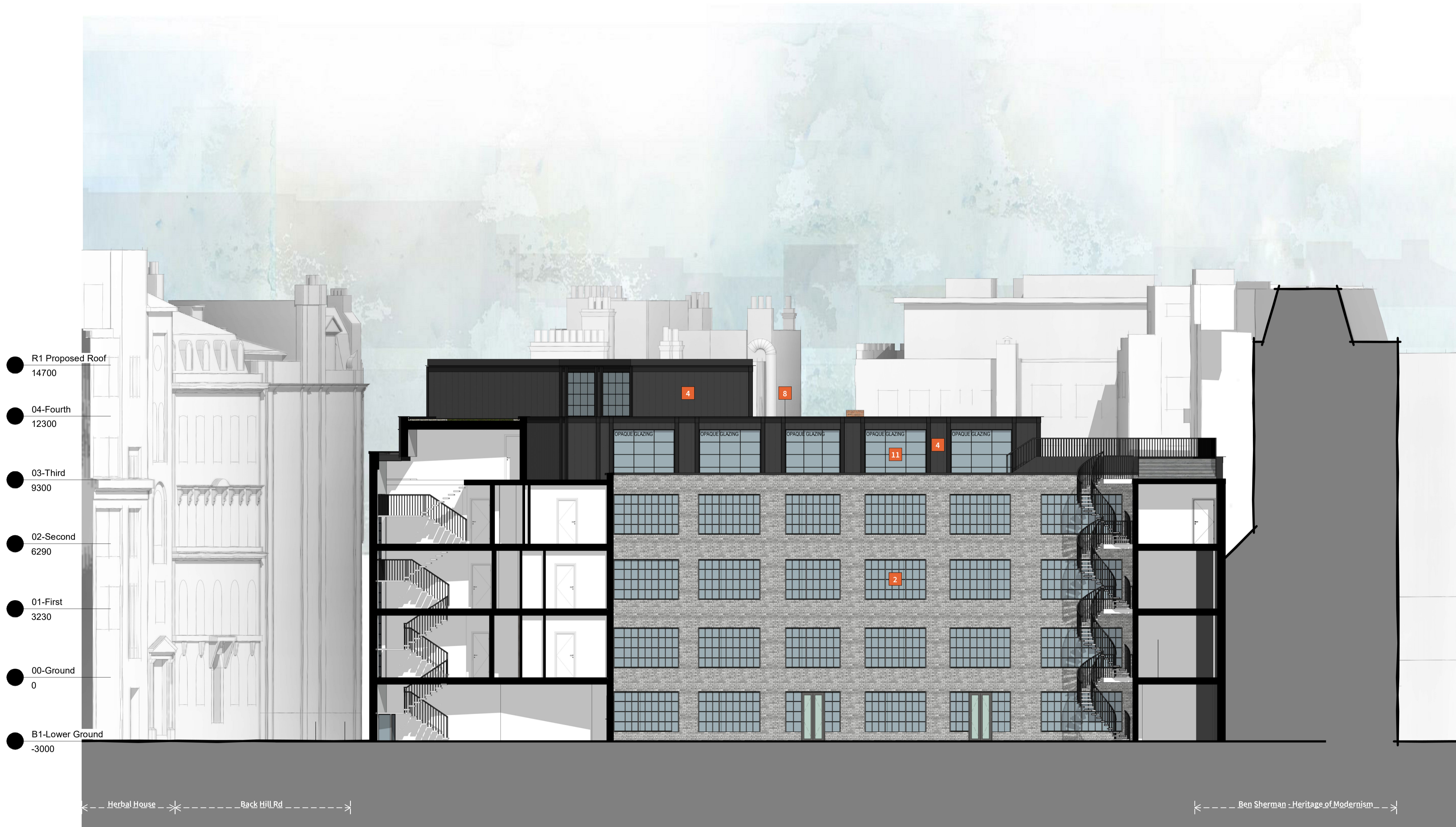
ZZ Proposed North Elevation 1 : 100