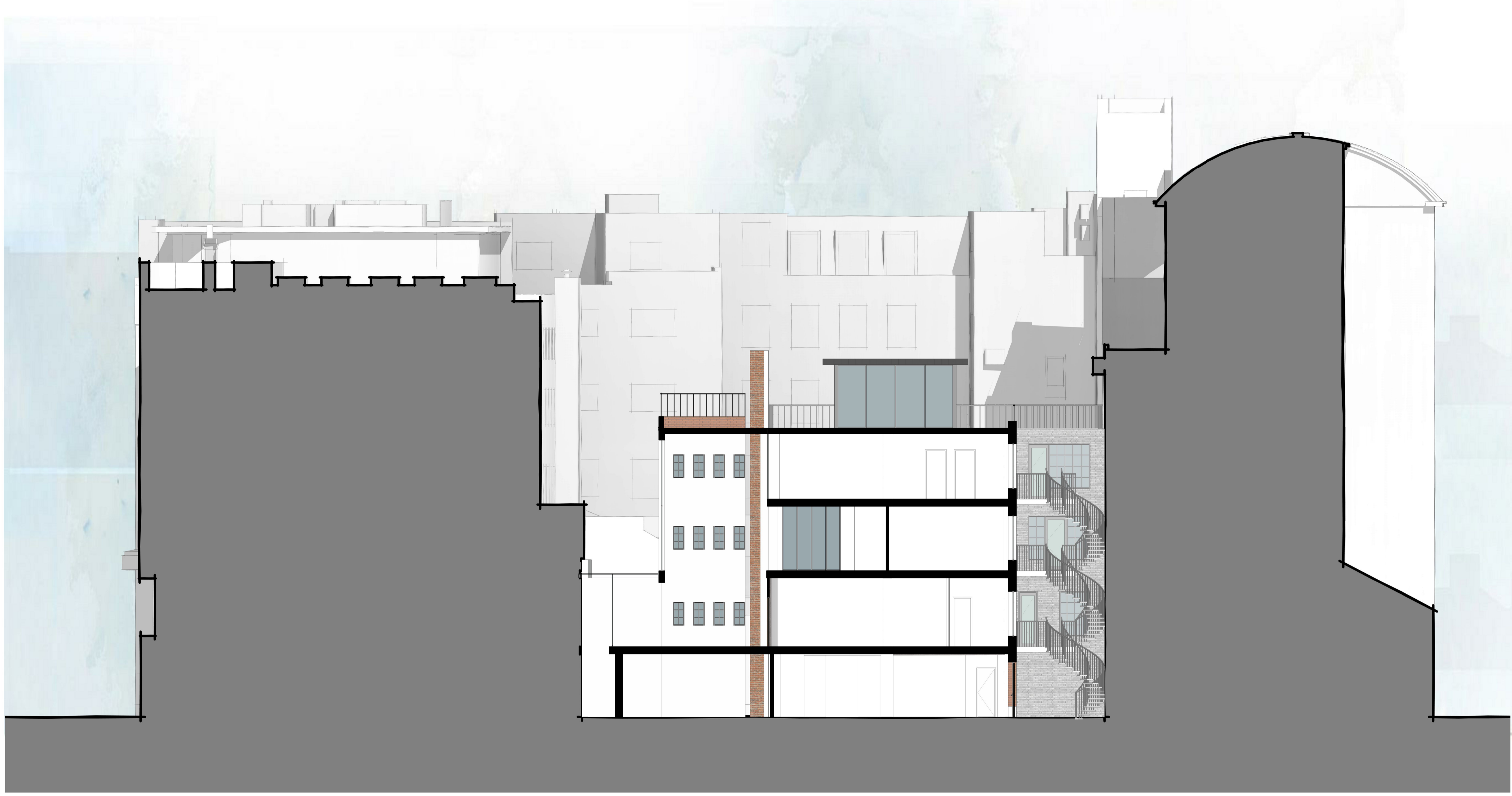
2 Section BB - Building As Existing 1:100