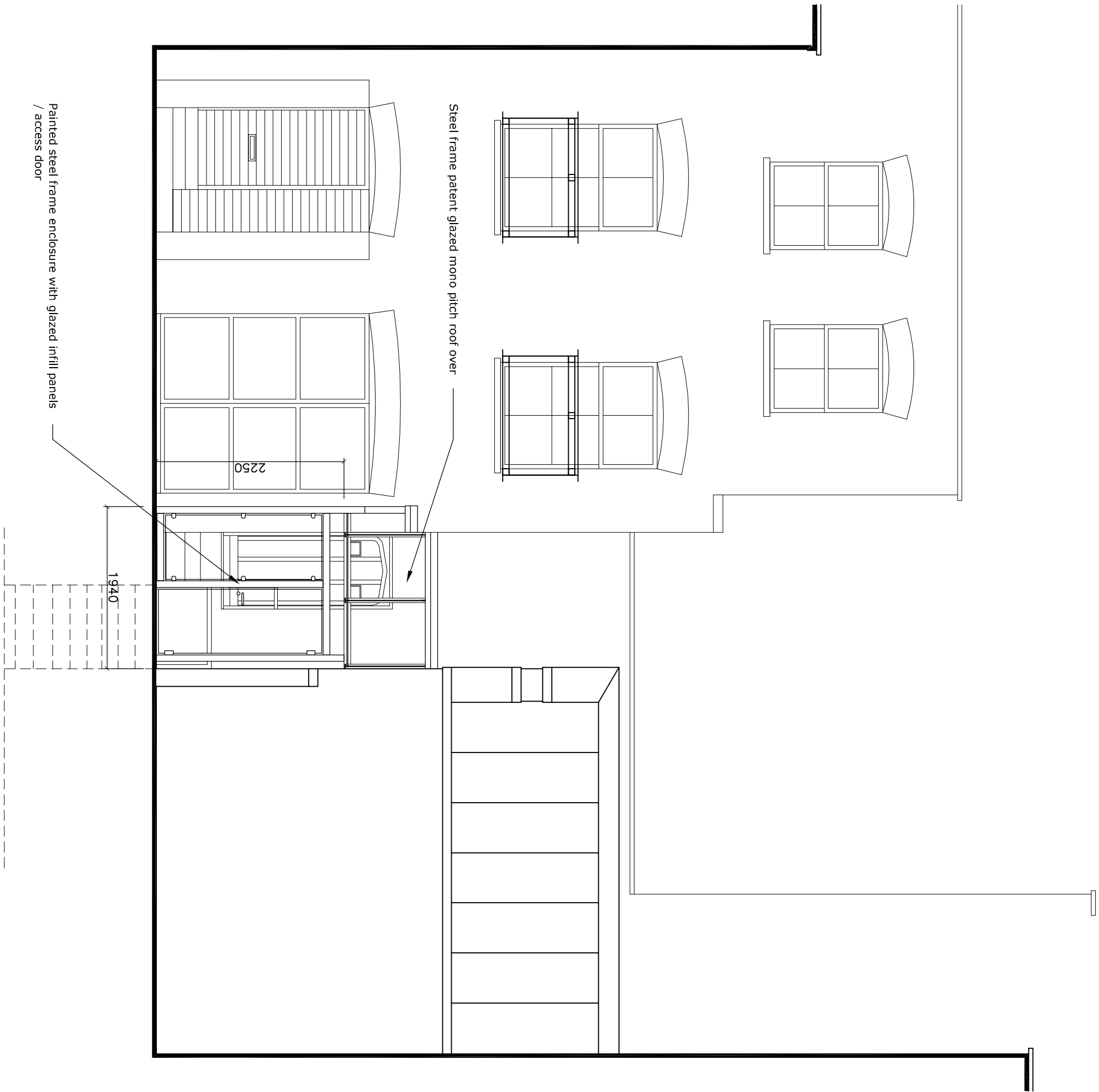
1. Proposed Elevation to Warren Mews - scale 1:50 @ A1