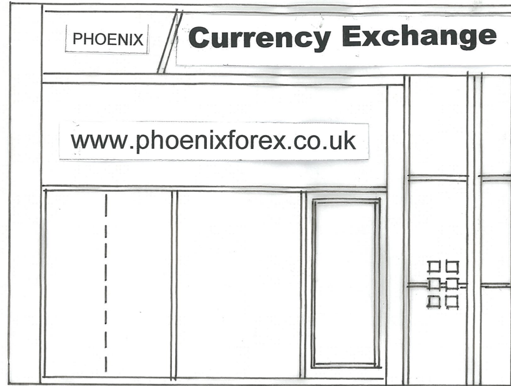
Existing Part Elevation