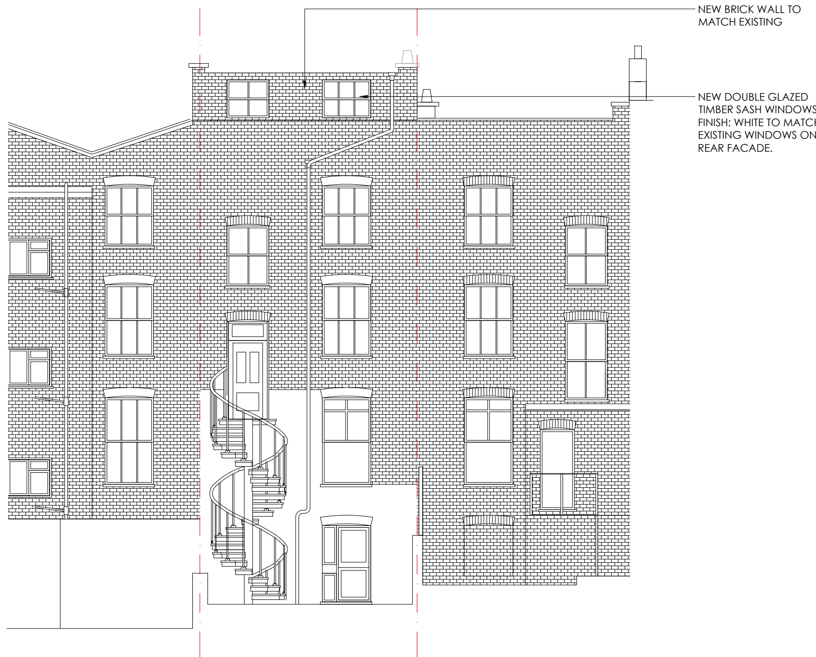
04 PROPOSED REAR ELEVATION 1:200 @ A3

DO NOT use drawing for construction. Used for Design Intent purposes only. DO NOT scale from this drawing. KAL to approve all finishes samples and shop drawings prior to manufacture. All dimensions discrepancies to be reported to KAL prior to manufacture.