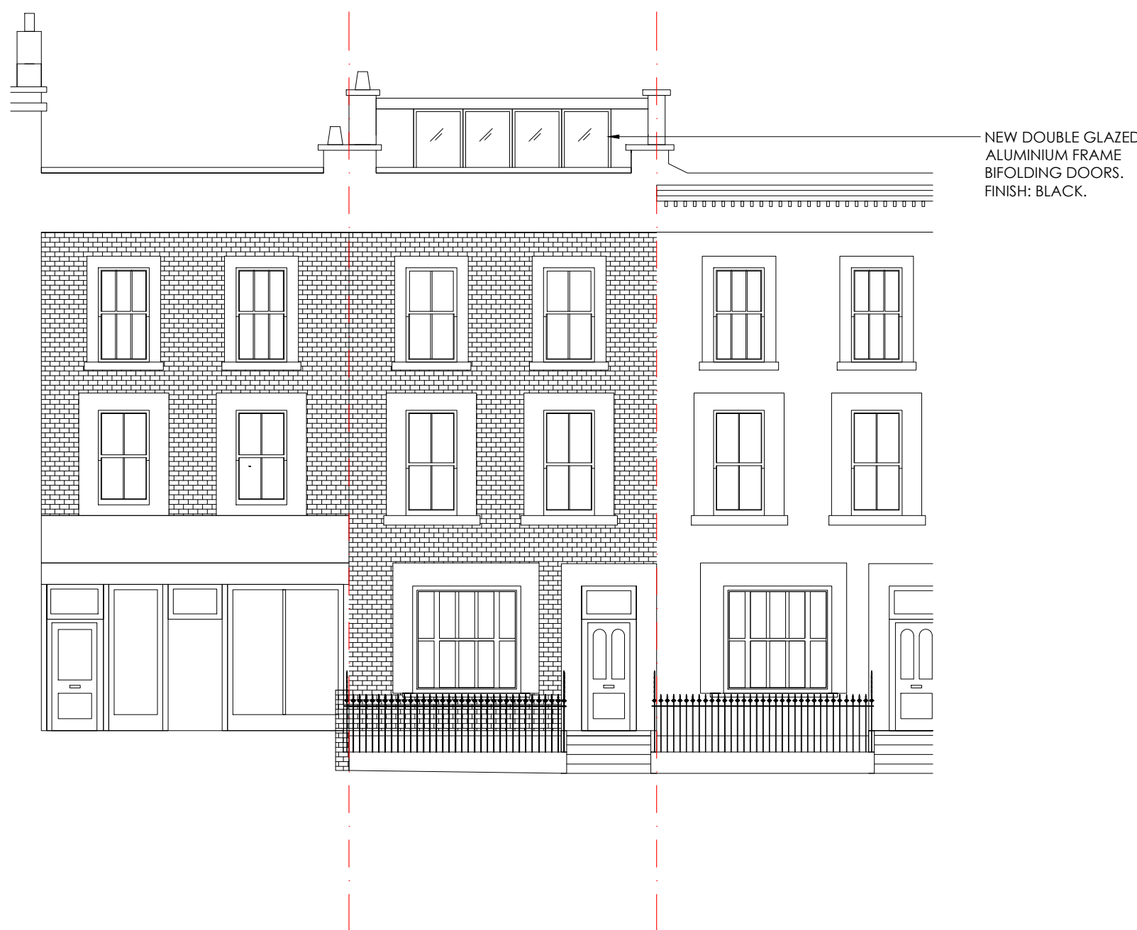
03 PROPOSED FRONT ELEVATION 1:200 @ A3