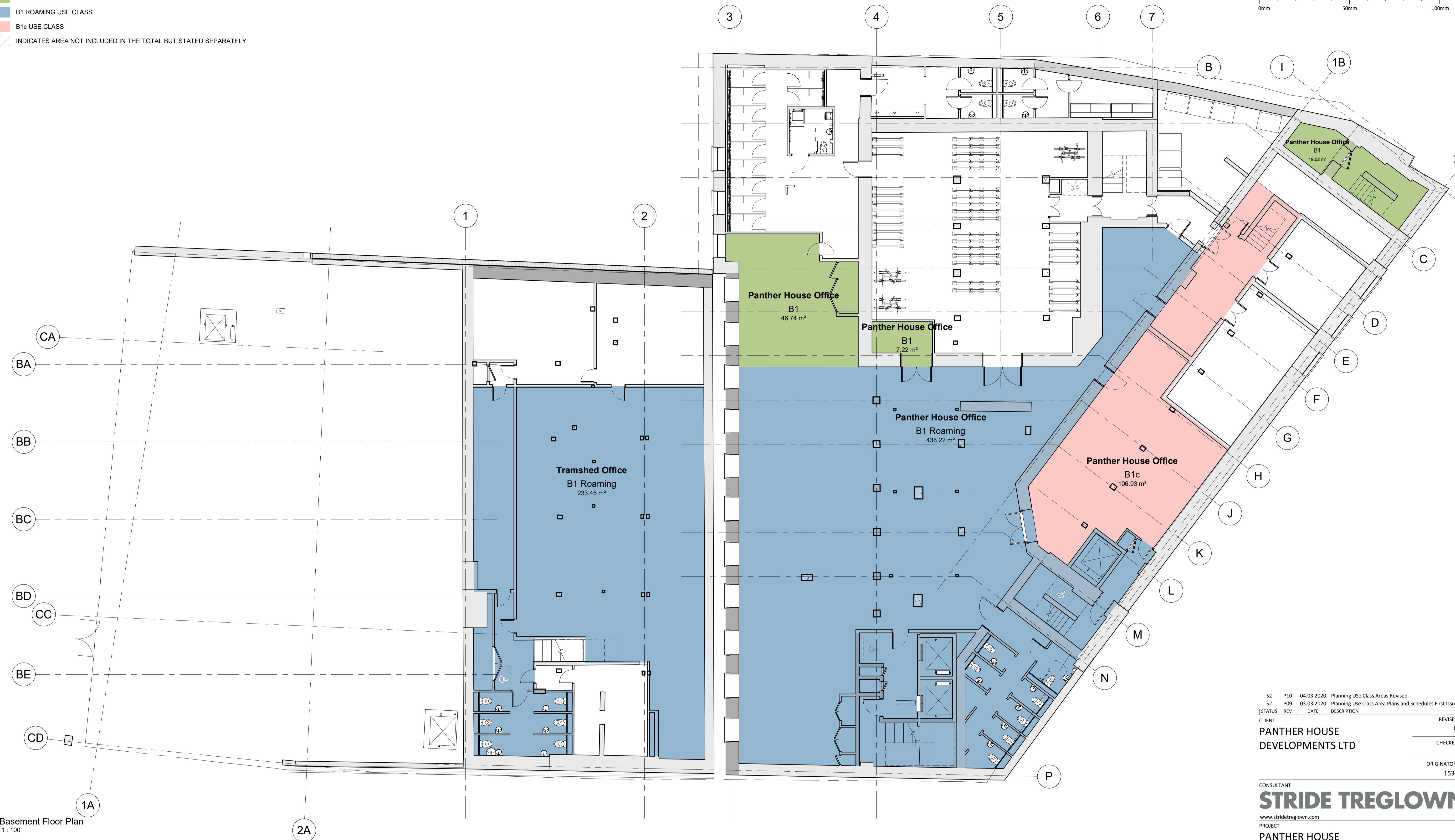
Basement Floor Plan 1 : 100