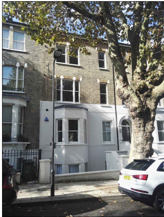
Front elevation - location of new gate to new steps down