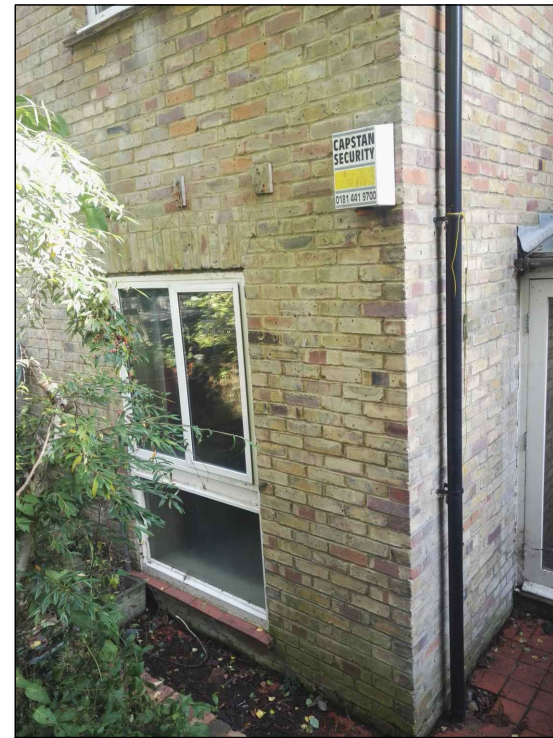
Part rear elevation - window to be replaced with french doors