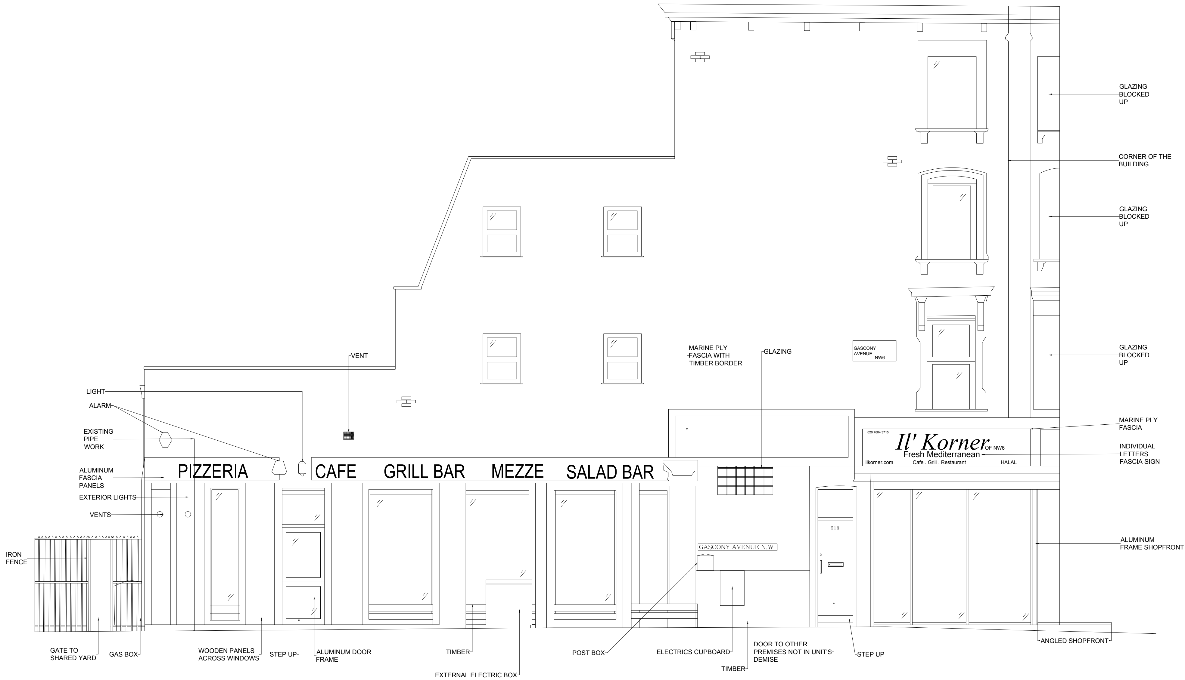
GASCONY AVENUE ELEVATION