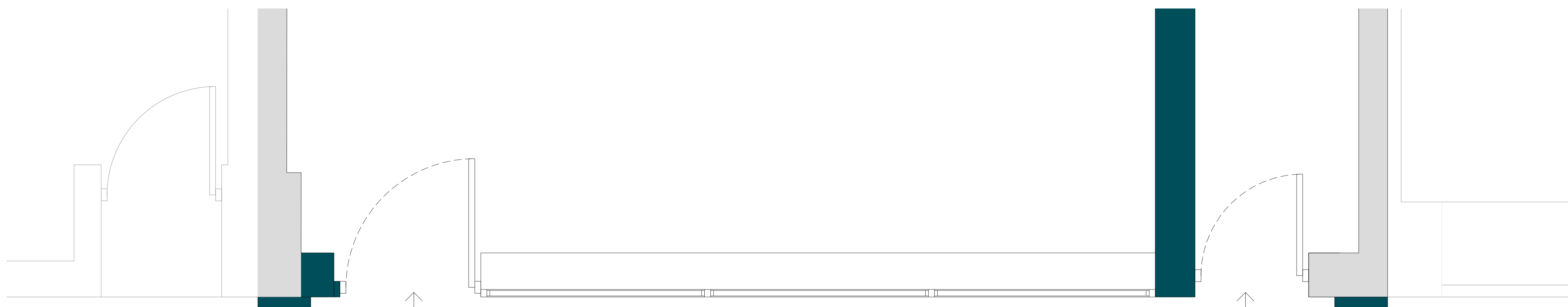
PROPOSED WINDOW DETAIL PLAN 1:20 @ A1