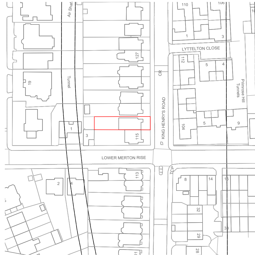
1 OS MAP 1:1250