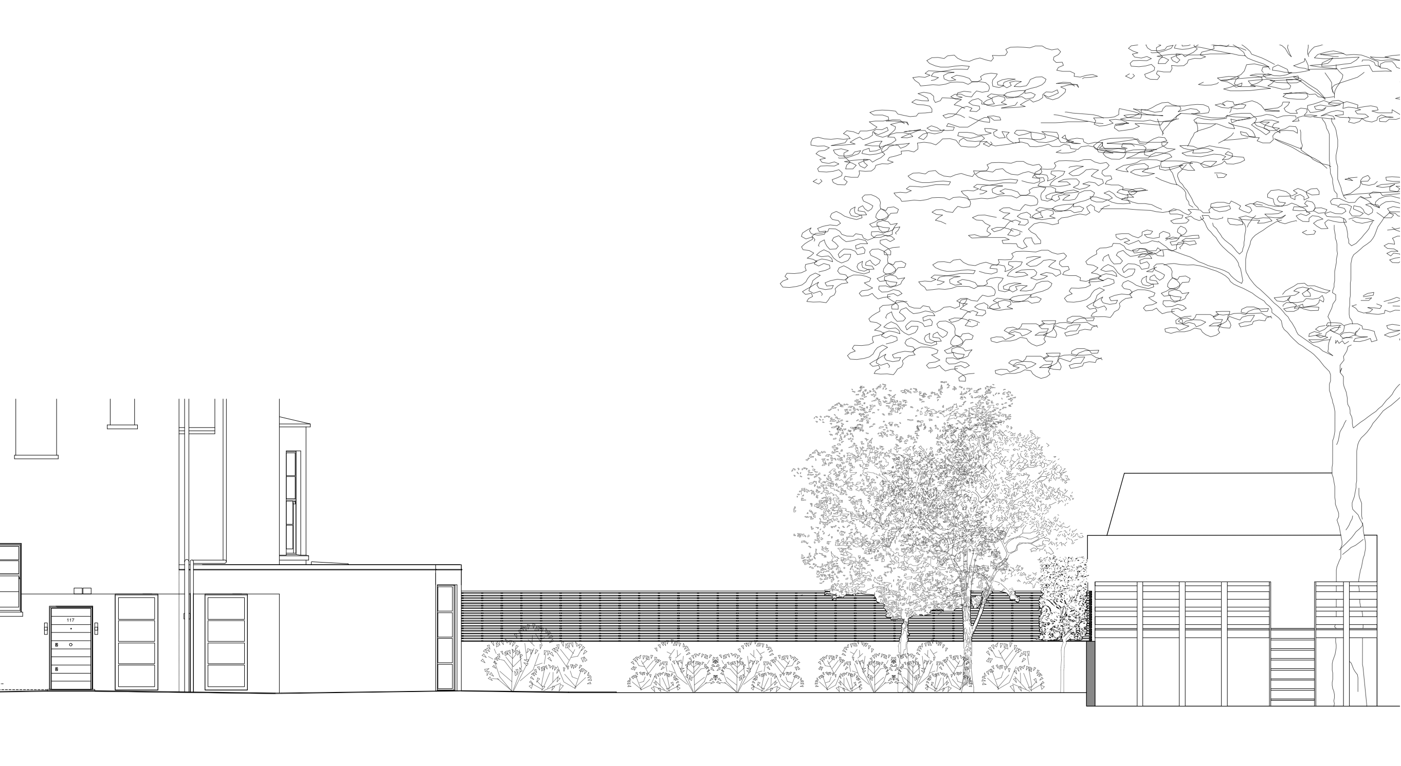
1 Existing Elevation West 1:100

© This drawing is the property of mitzman architects. No disclosure or copy of it may be made without the written permission of Mitzman Architects.