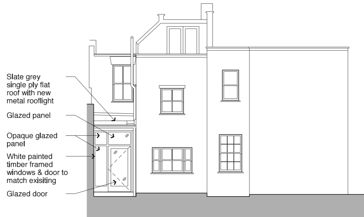
Proposed Rear Elevation Scale 1:100