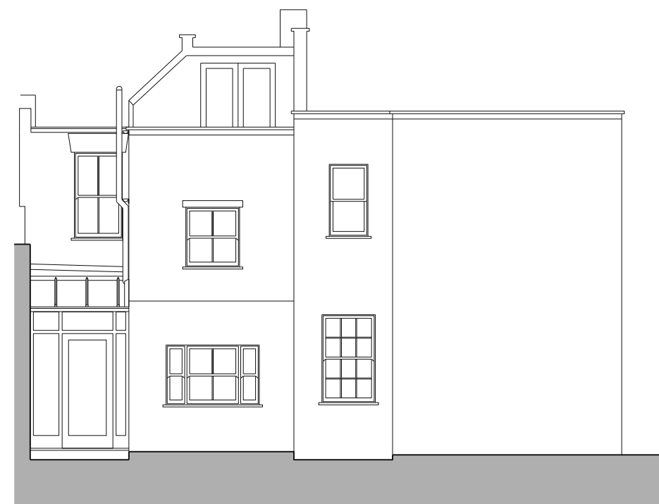
Existing Rear Elevation Scale 1:100