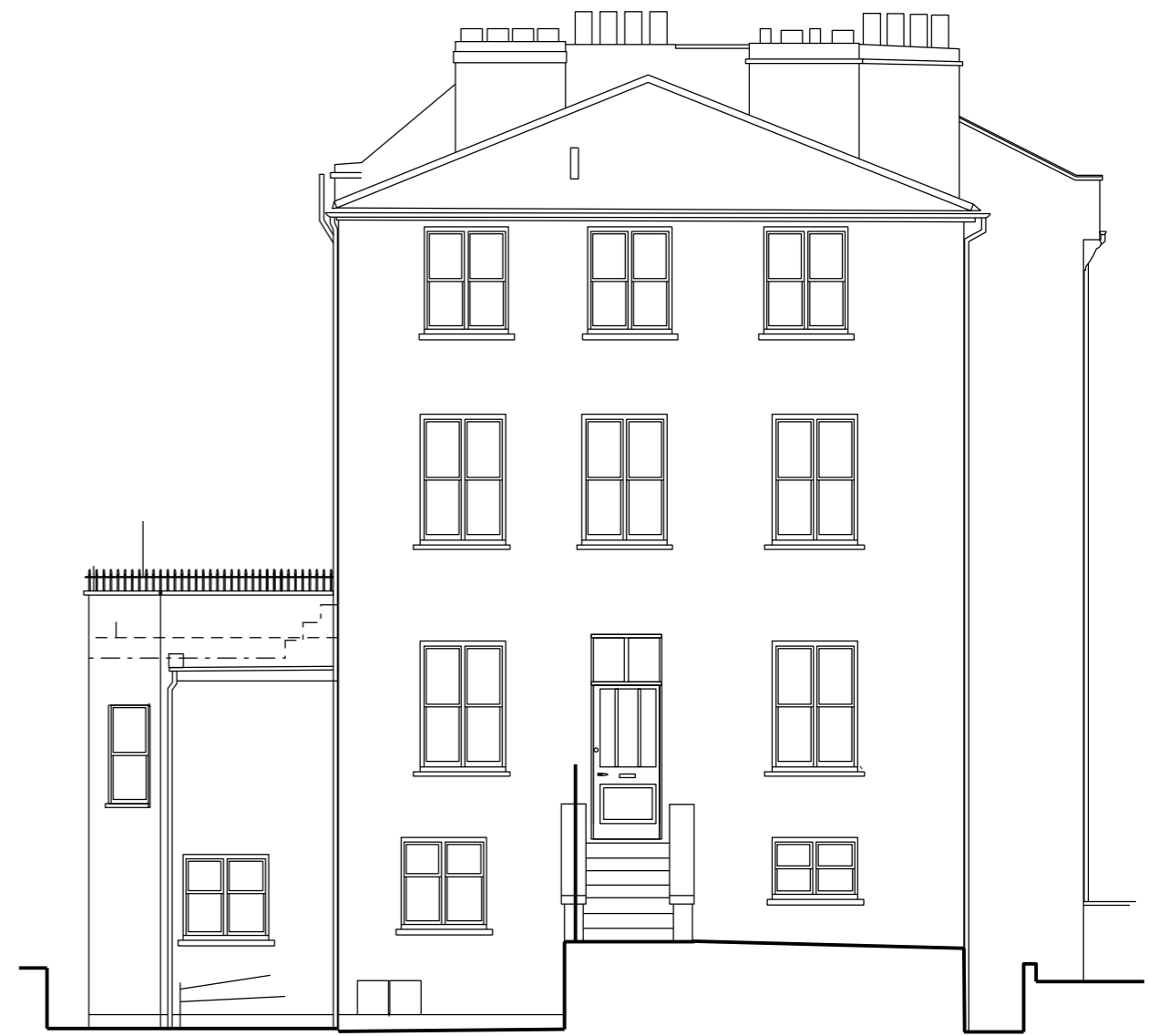
ELEVATION 2 AS PROPOSED 1:20