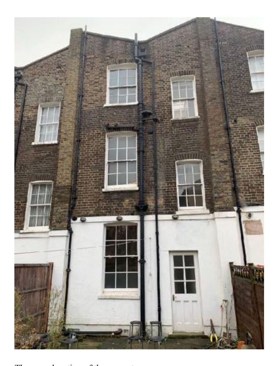
The rear elevation of the property