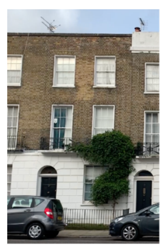
The front facade of No12