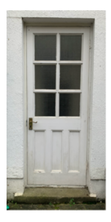
The existing door in the rear