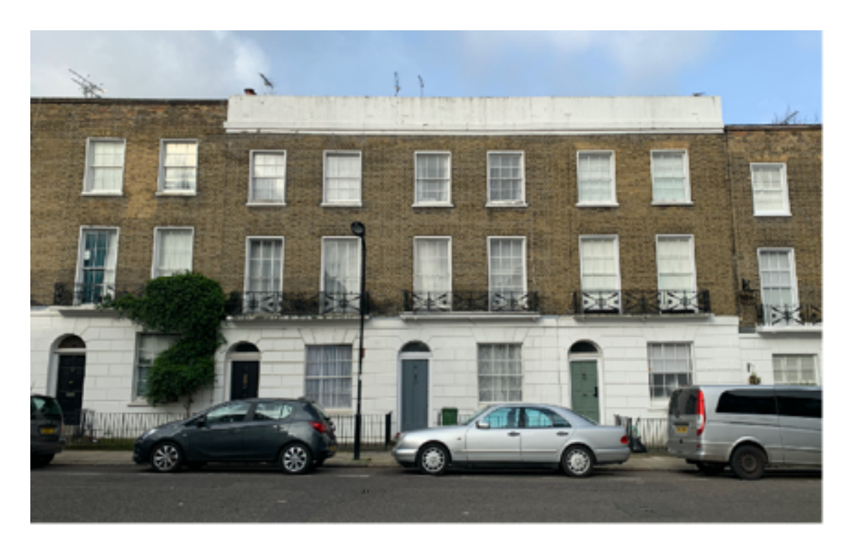
The row of houses in Medburn Street with No12 to the far left of the photo.