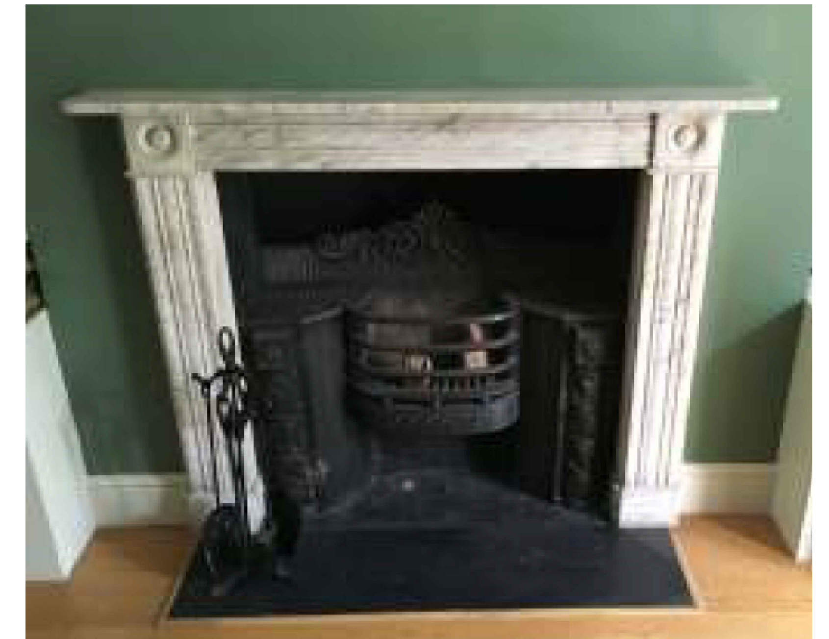
Reference photo of proposed hearth and surround