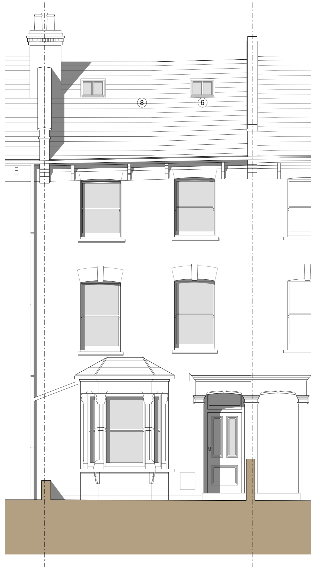
FRONT (OAKFORD ROAD) ELEVATION