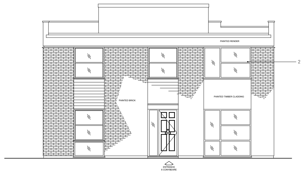
EXISTING FRONT ELEVATION 1:100