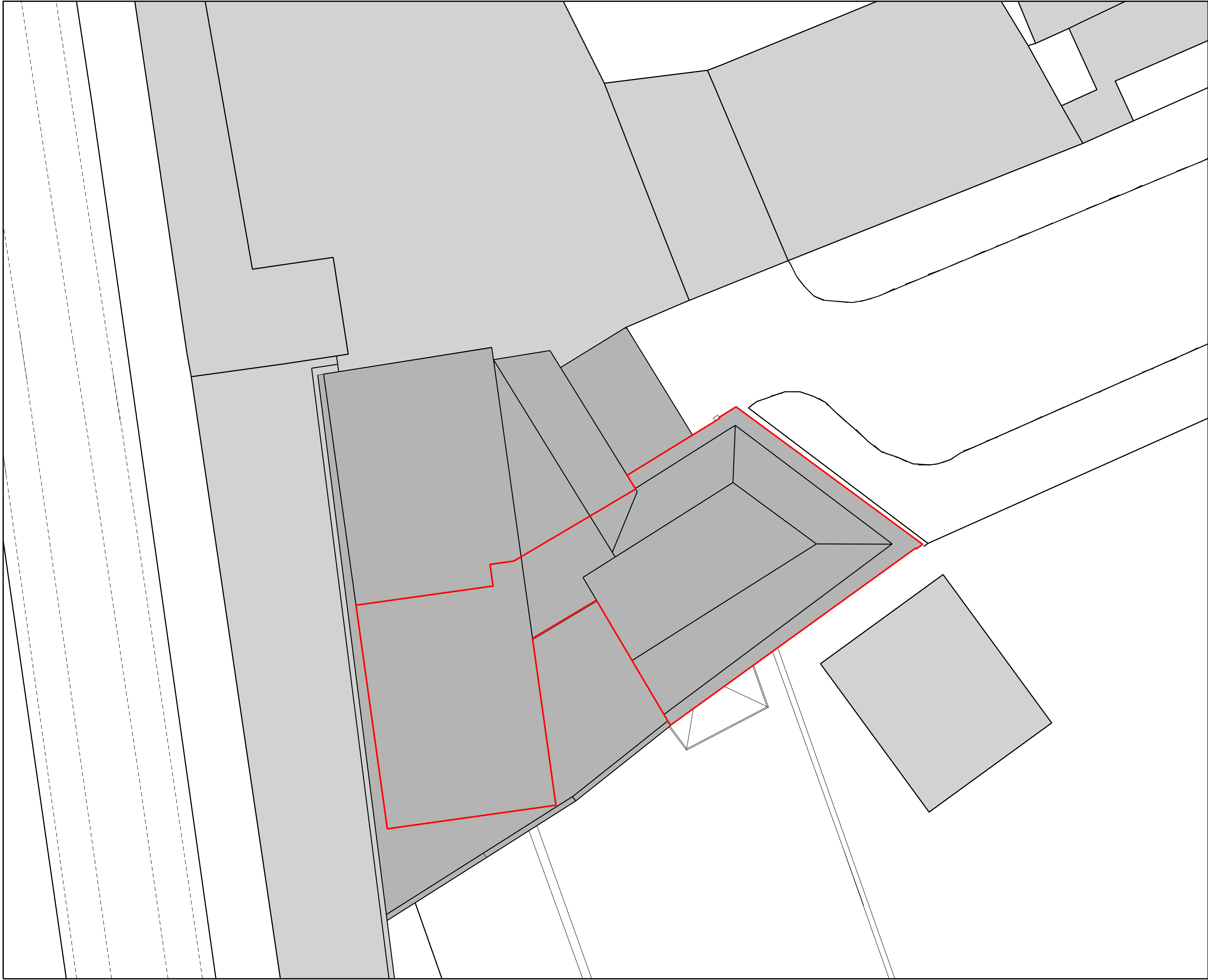
02 SITE BLOCK PLAN SCALE 1:200 @A3 0m 1m 3m 5m 10m SCALE