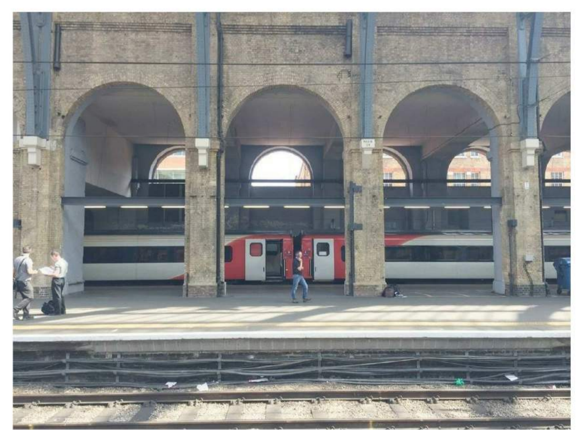
Photo 2 from Platform 2