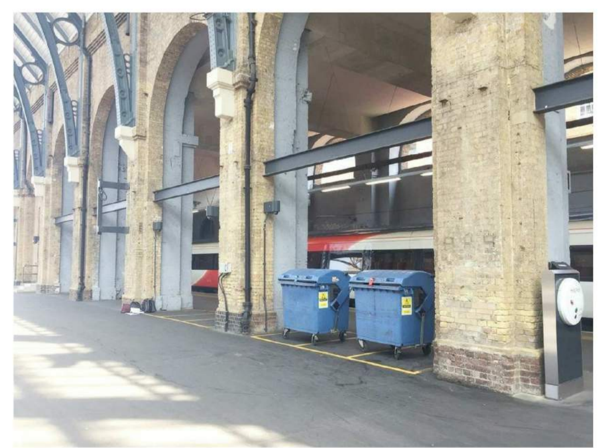
Photo 1 from Platform 1